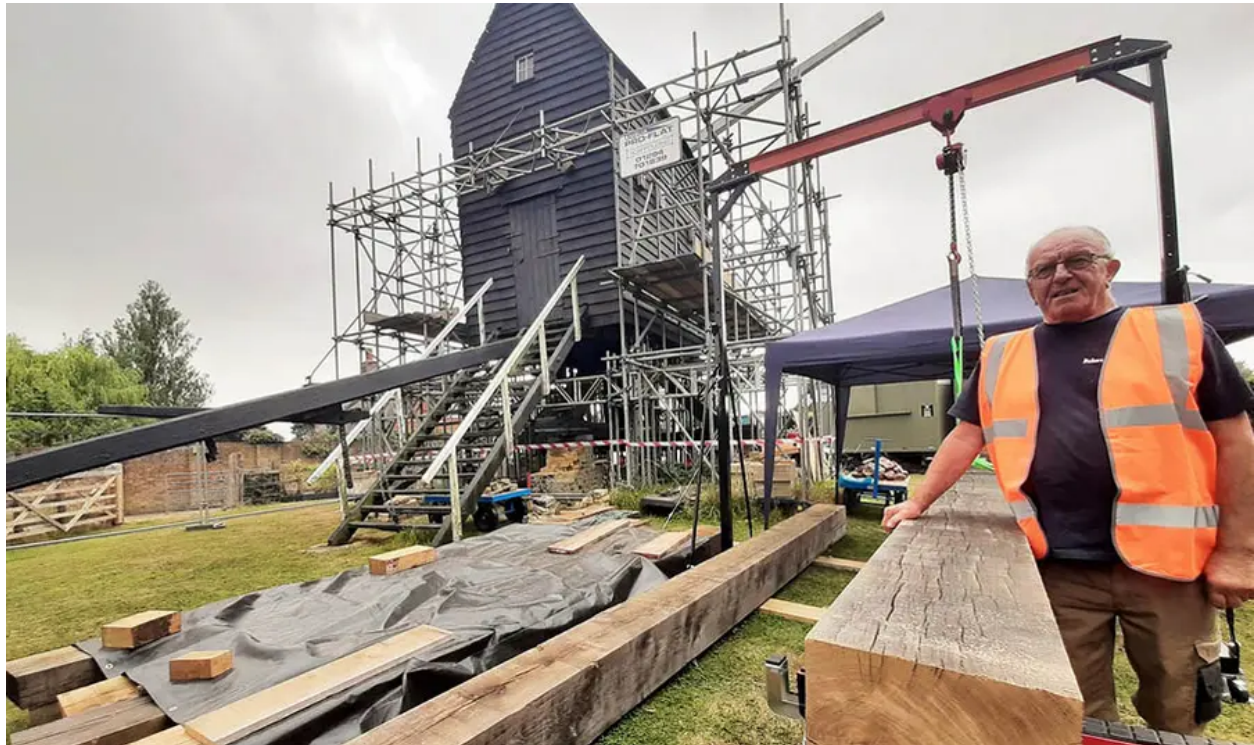
Scaffolding lifted the mill while the huge oak beams that support it were replaced.

The supporting wooden tresses and brick foundations have been replaced, ensuring the mill’s survival for future generations to learn about this part of the UK’s industrial heritage.