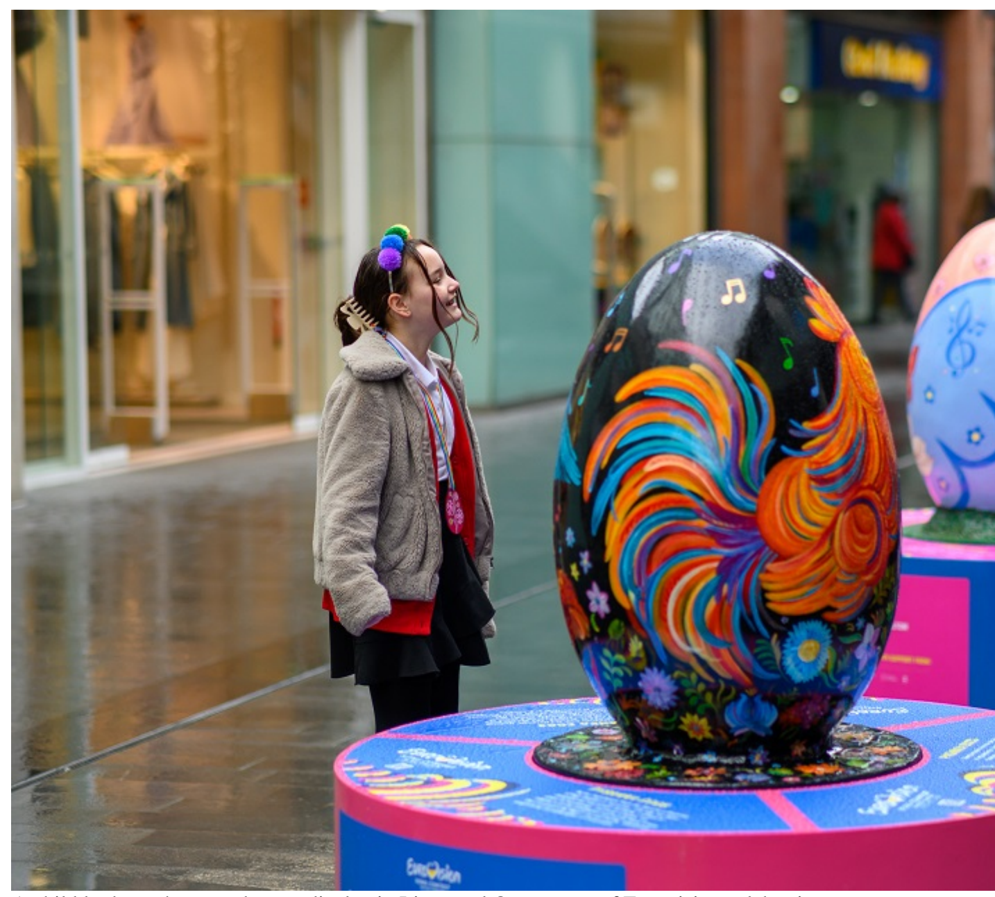
A child looks at the pysanka egg display in Liverpool One as part of Eurovision celebrations.

EuroLearn has also seen the city region overtaken by seven giant eggs decorated in the pysanky tradition of Ukraine and Eastern Europe. There is a pysanka egg from each local authority of the city, decorated by members of the Ukrainian community.