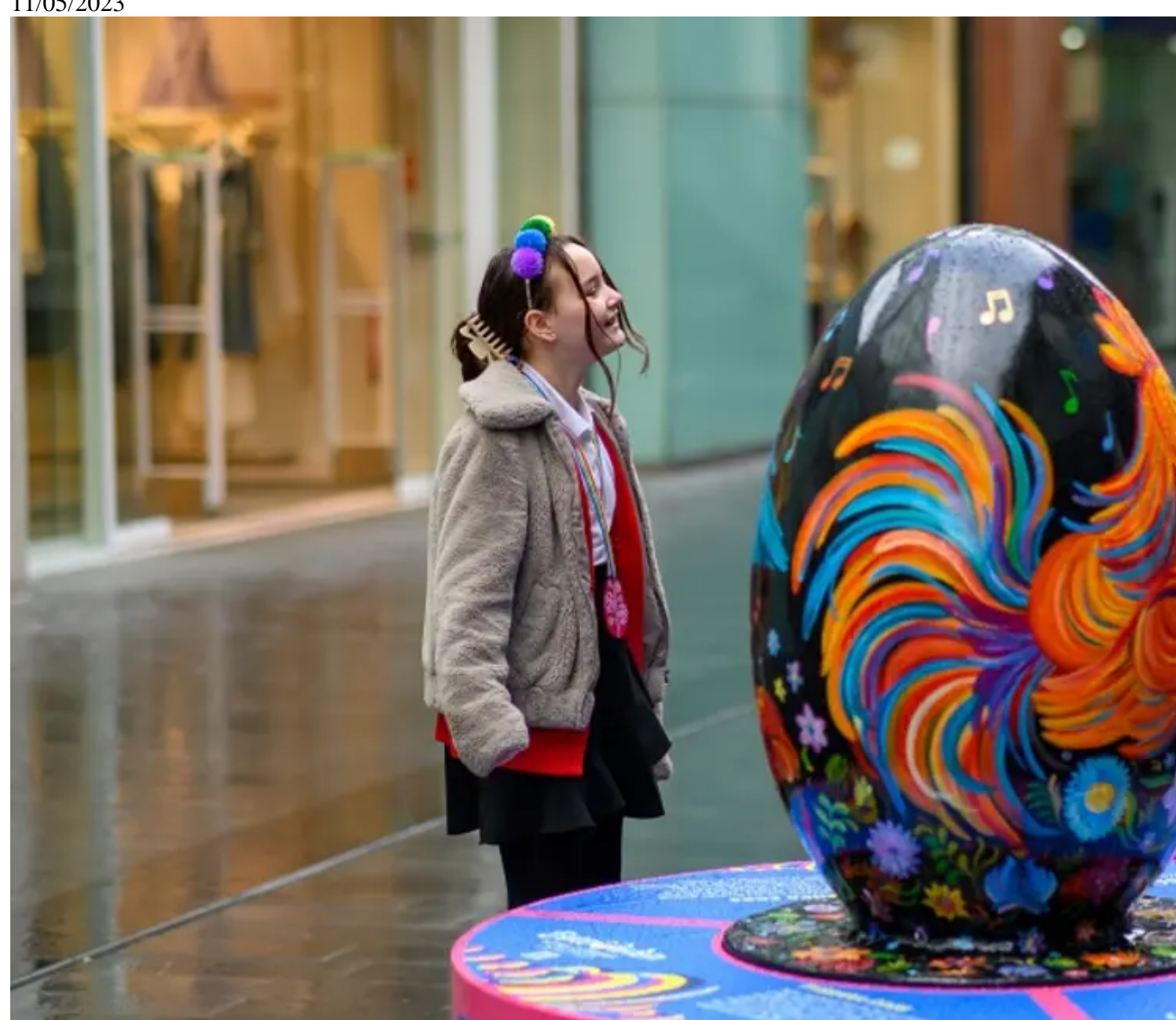
Children with the pysanka egg display for Eurovision. Thanks to £250,000 of National Lottery funding, we're supporting a host of activities as part of the Eurovision 2023 celebrations.

EuroFest is the cultural festival taking place alongside the song contest and features the community and education programmes known as EuroStreets and EuroLearn.