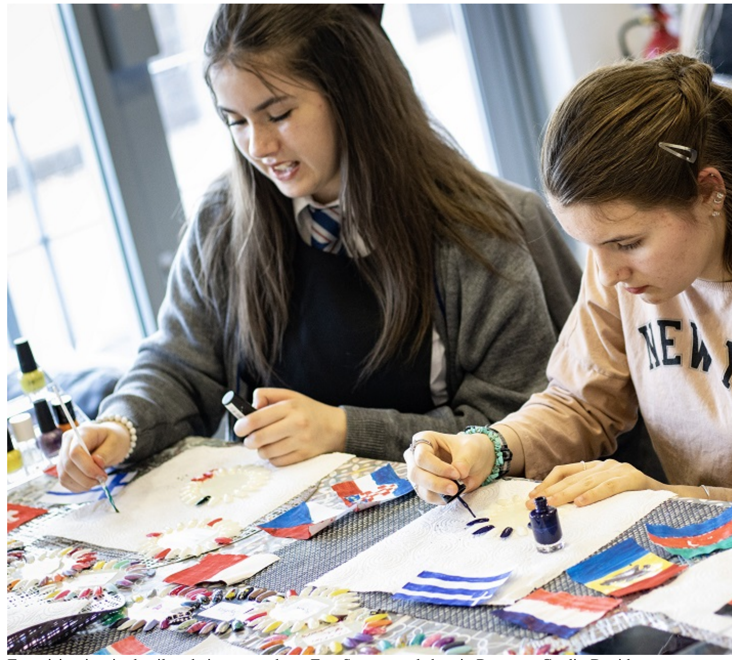
Eurovision-inspired nail art being created at a EuroStreets workshop in Runcorn.

Projects that were successful in getting funding include: