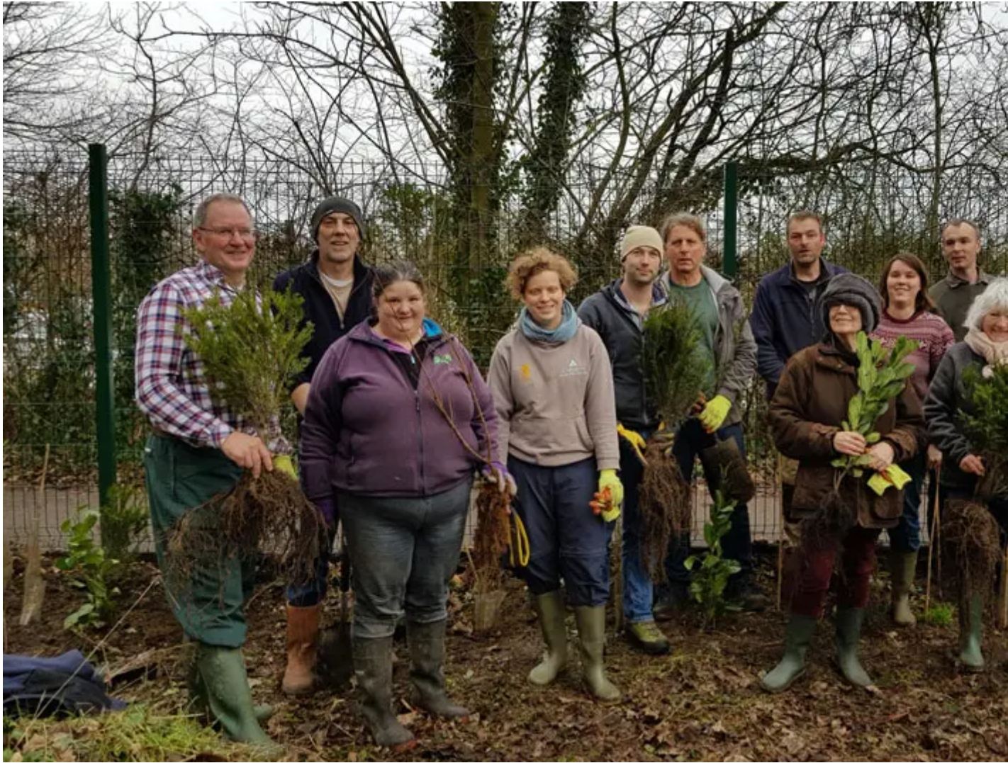
Planting new hedgerow at the museum.

The Food Museum was chosen for its campaign Hedgerow, which demonstrated sustainable thinking at its core.