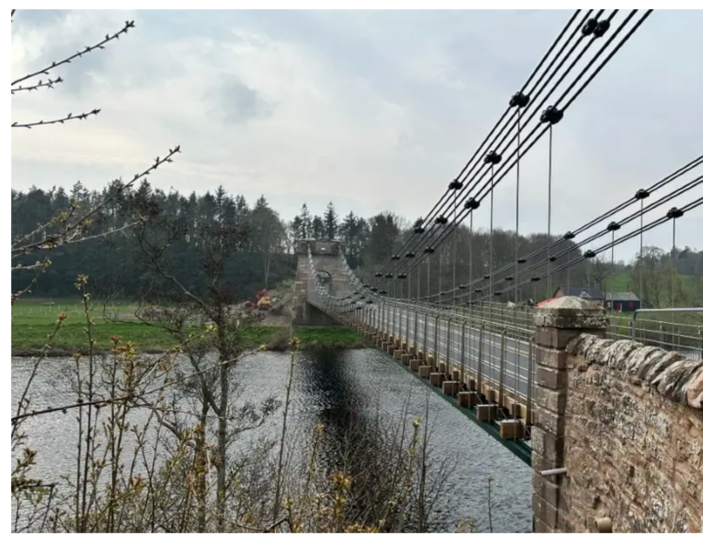
The Union Chain Bridge.

The restoration work has combined the traditional workmanship used when the bridge was first built with state of the art technical engineering and techniques used in Alpine ski resorts. The innovative ski-lift technology will help to ensure that the bridge will continue to be a standout heritage landmark for years to come.