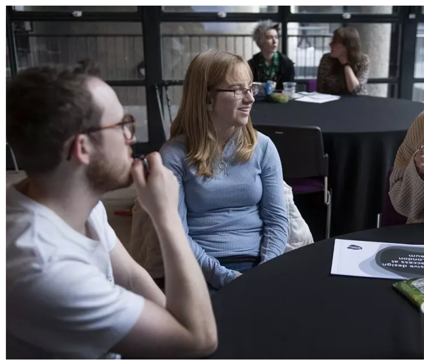
Fellows at the Curating for Change residential event, taking notes, discussing and watching presentations.