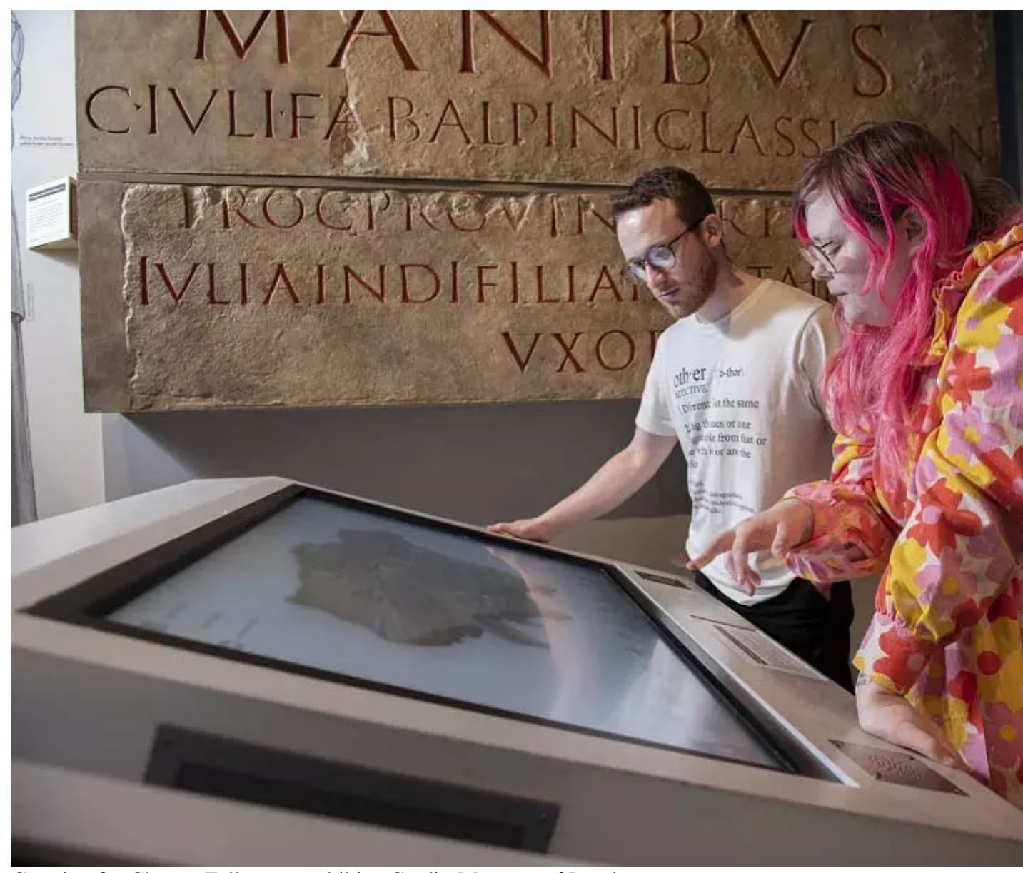
Curating for Change Fellows at exhibits.