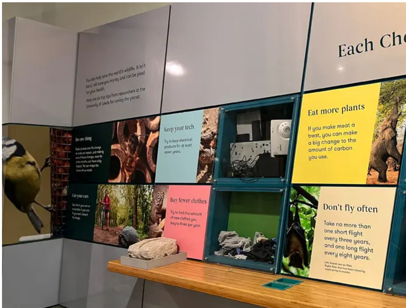
Messaging to inspire positive change in the Life on Earth gallery.

How do you deliver a permanent gallery in the most environmentally sustainable way? While refitting the natural science gallery, Leeds City Museum considered this question taking learnings from work on temporary exhibitions.