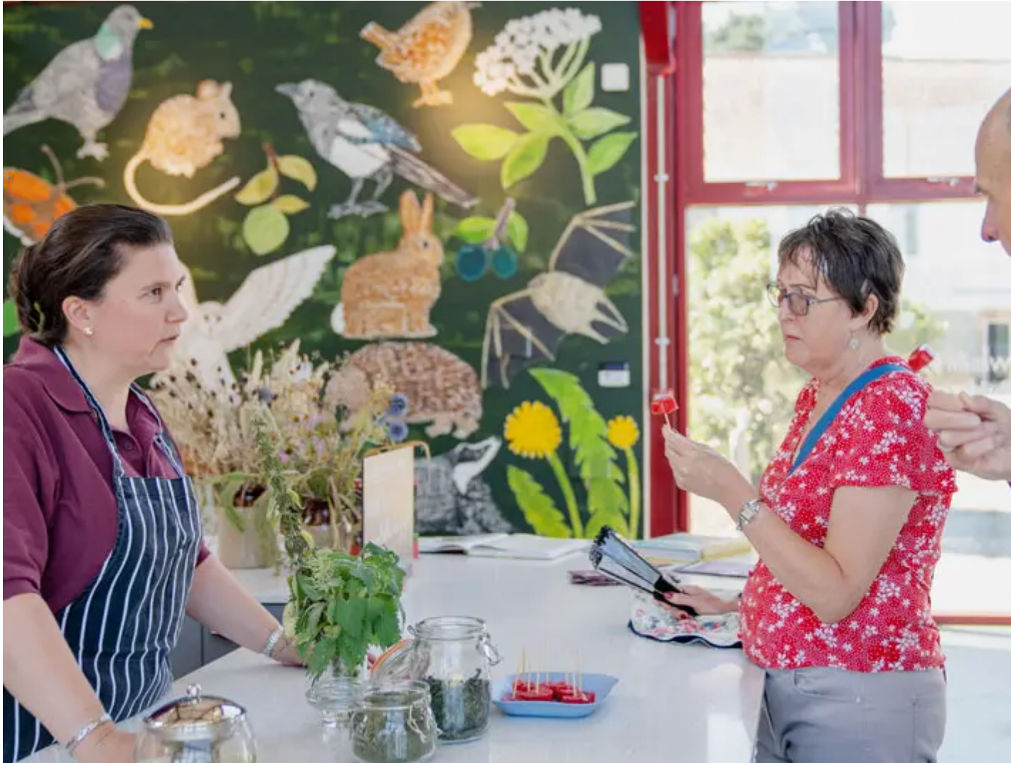
Nettle recipe demonstrations at the Food Museum.

Hedgerow is an exhibition, campaign and programme of activities celebrating one of our most recognisable habitats – the hedgerow – and crafts which relate to it.