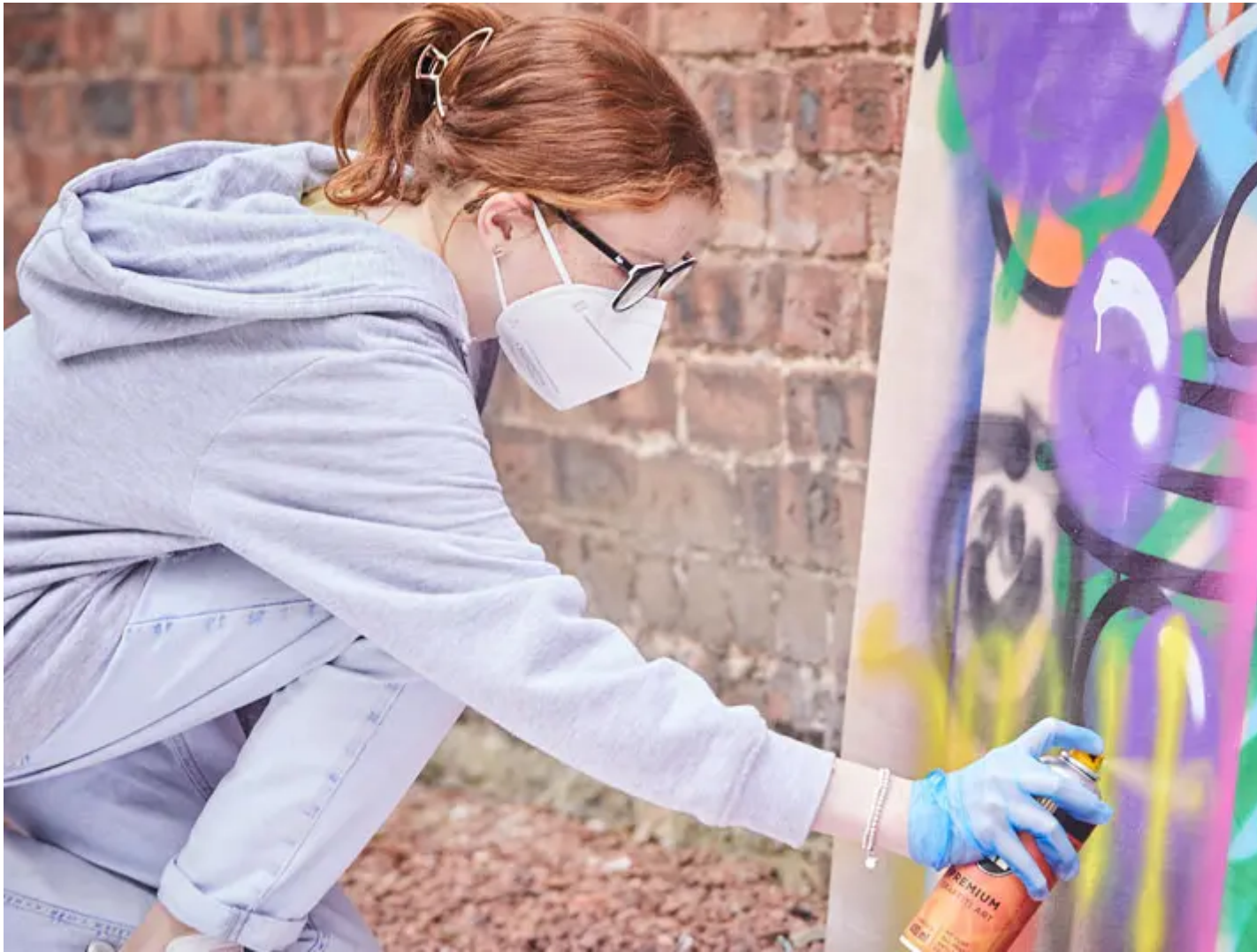
A young person creates a placard inspired by Angry Dan's mural.

Once Upon A Planet (OUAP) uses Tullie's collections to provoke conversation, reflection and action on the climate crisis, focusing on younger generations' spirit of protest and positive change.