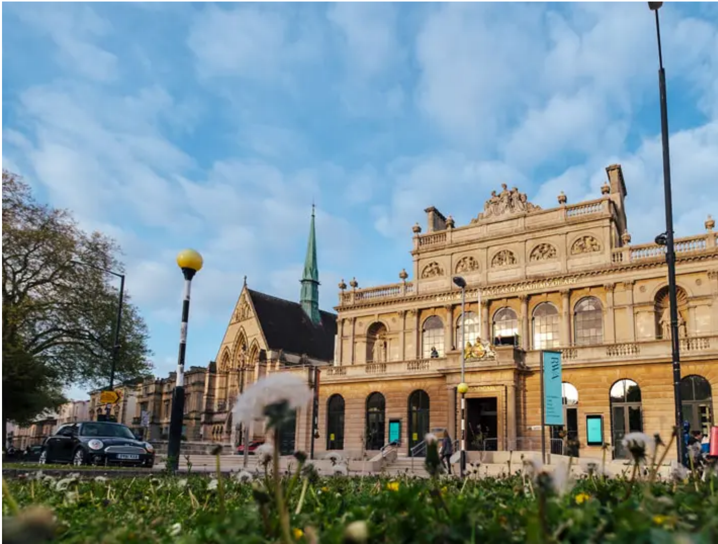
RWA exterior following capital works.

RWA's project ' Light and Inspiration ' transformed the environmental sustainability of the Grade II* listed building through a combination of replacing infrastructure, negotiating green energy and introducing wildlife-friendly planting.