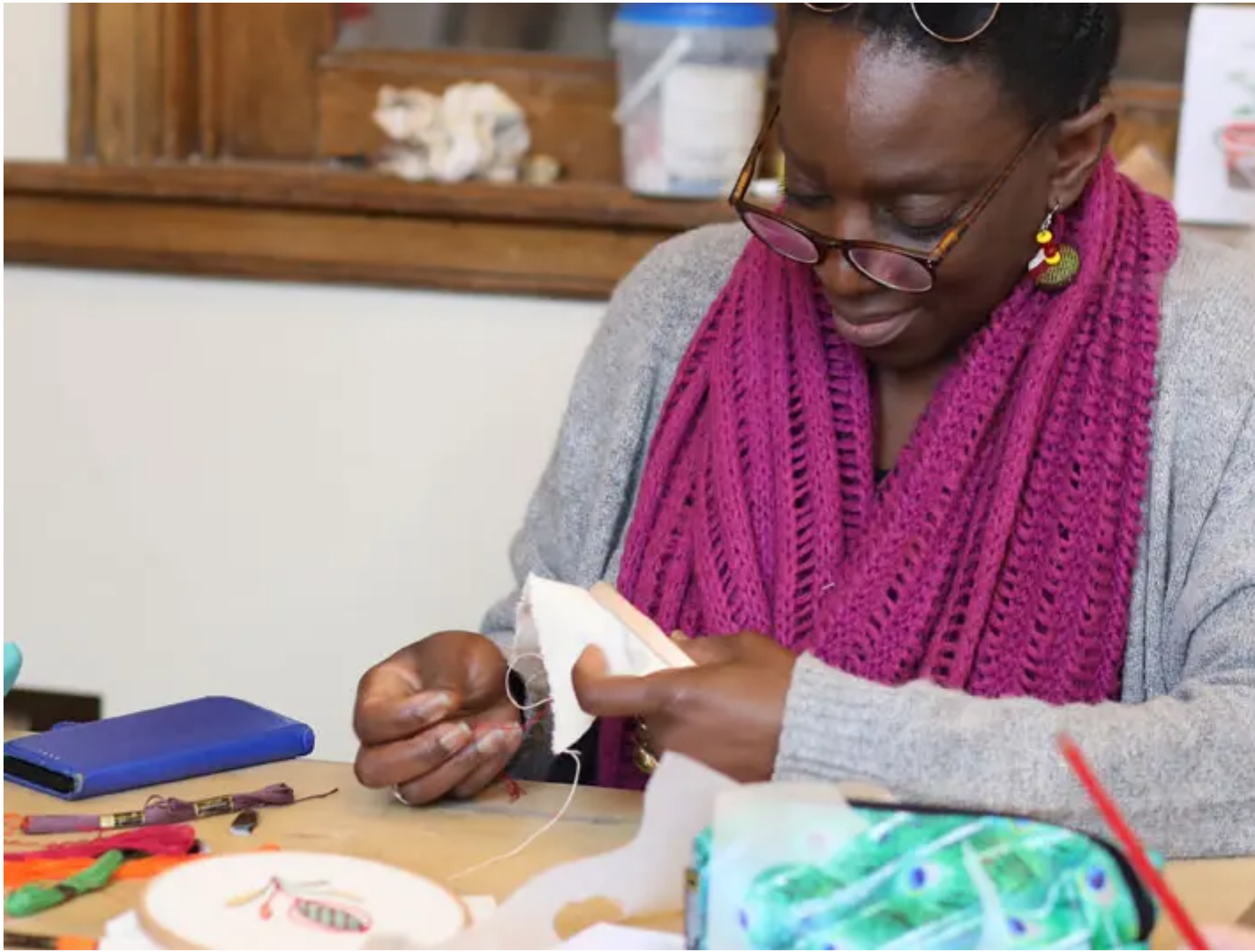
Volunteer working on textile crafts.

Originally commissioned, designed and built by and for the local community, Erith's Old Library served residents for over 100 years before falling into disrepair and finally closing in 2009.