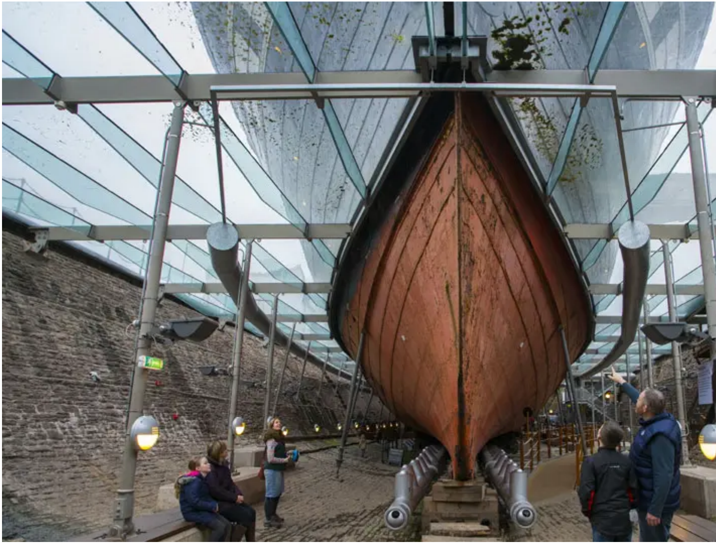
Visitors in the dry dock can see the unique conservation system on display.

SS Great Britain is conserved in its original dry dock with two giant bespoke dehumidifiers preventing the fragile iron from corroding. The new Ship's Conservation Engineer designed upgrades with environmental sustainability in mind, leading to ground-breaking energy optimisation.