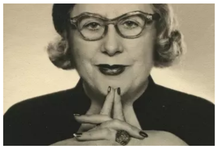
Self Portrait, 1956

The exhibition was made possible thanks to the <u>New Stories</u>, <u>New Audiences grant scheme</u>, run by the <u>Association of Independent Museums (AIM)</u>. Supported by £786,900 of National Lottery funding, the scheme helps small museums across the country to broaden their audiences and tell new stories.