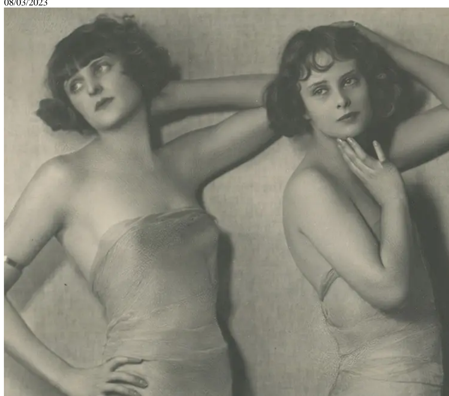
Frieze, 1923 Works by the photographer – who took the iconic portrait of the young Queen Elizabeth II featured on UK stamps – go on show in Gloucester thanks to National Lottery funding.