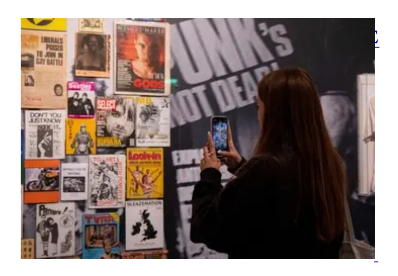
Display of gig posters at The Museum of Youth Culture The Museum of Youth Culture