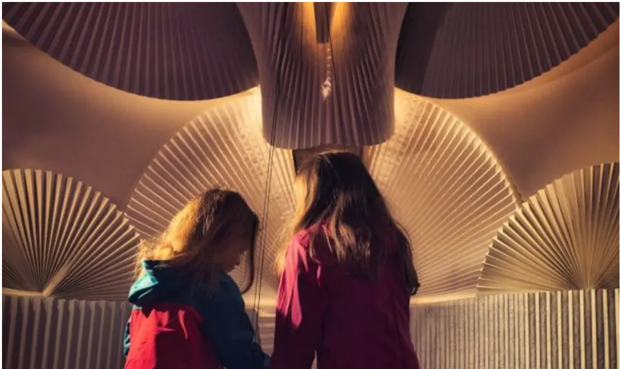
The sand pendulum exhibit's backdrop is made from window blinds arranged into decorative shapes and patterns.

“It feels good to make use of things and it can be a wonderfully creative process to deconstruct used objects into functional parts, shapes and patterns and to see the potential and beauty in unwanted things. I really enjoyed taking old window blinds, embracing their imperfection and playing with their patterns to make the backdrop for the sand pendulum exhibit.”