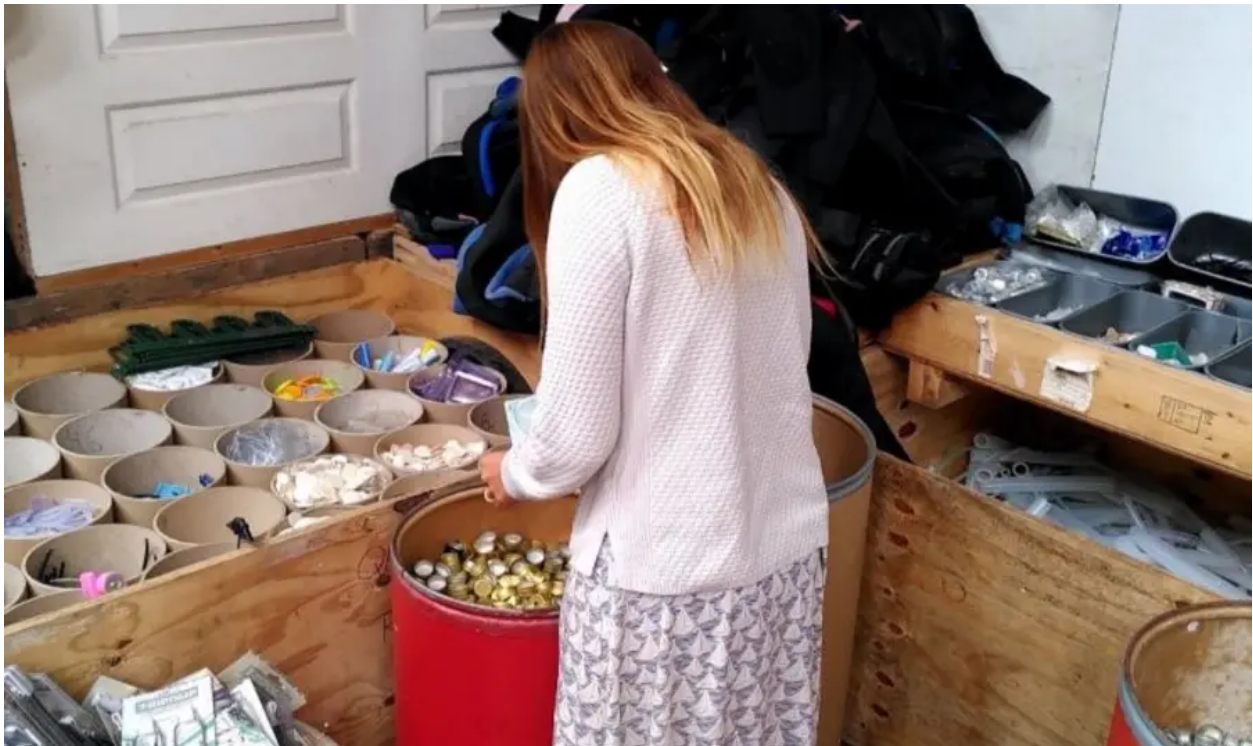
Using waste materials found in a scrap store.

Previous winners of the Sustainable Project of the Year category were Penzance's Jubilee Pool and the Museum of Oxford's Queering Spires: a history of LGBTIQA+ spaces exhibition.