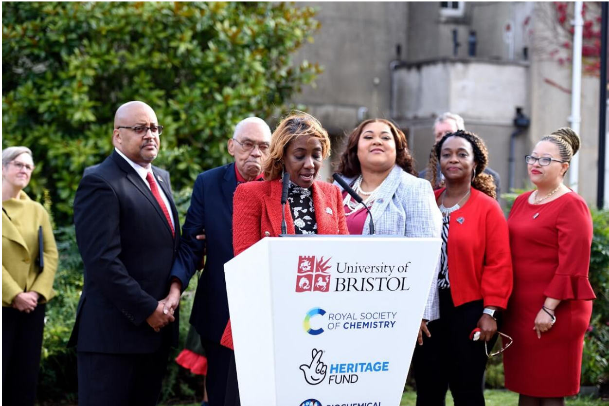
The Henrietta Lacks statue is unveiled by some members of the Lacks family.

The scientists who used Henrietta's cells in their research won awards and recognition, but rarely knew who she was. The continued use of the cells remains controversial, both inside and outside of the biomedical research community.