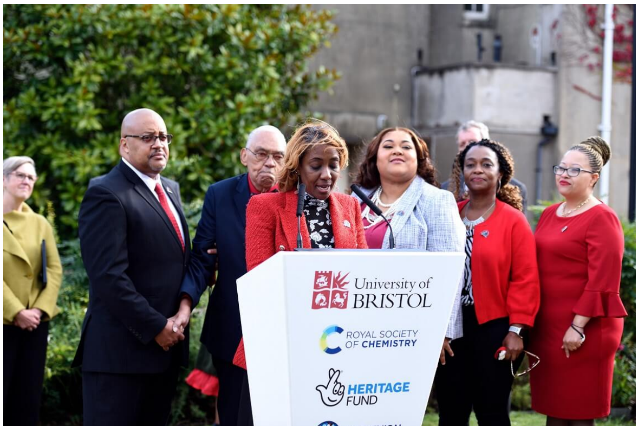
The Henrietta Lacks statue is unveiled by some members of the Lacks family.

The scientists who used Henrietta's cells in their research won awards and recognition, but rarely knew who she was. The continued use of the cells remains controversial, both inside and outside of the biomedical research community.