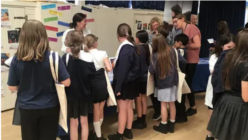
Activities engaged pupils of all ages.

Free primary and secondary school resources were shared online inspired by Henrietta's story, covering topics from science, medicine and art to history, humanities and philosophy. Older pupils visited the university's lecture theatres and teaching laboratories to learn more about cell biology and use the lab's high-tech microscopes.