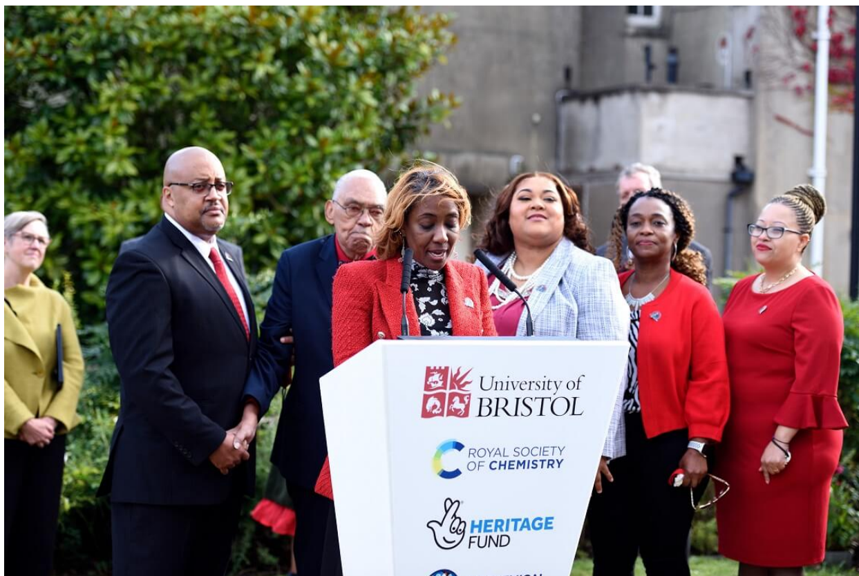
The Henrietta Lacks statue is unveiled by some members of the Lacks family.

The scientists who used Henrietta's cells in their research won awards and recognition, but rarely knew who she was. The continued use of the cells remains controversial, both inside and outside of the biomedical research community.