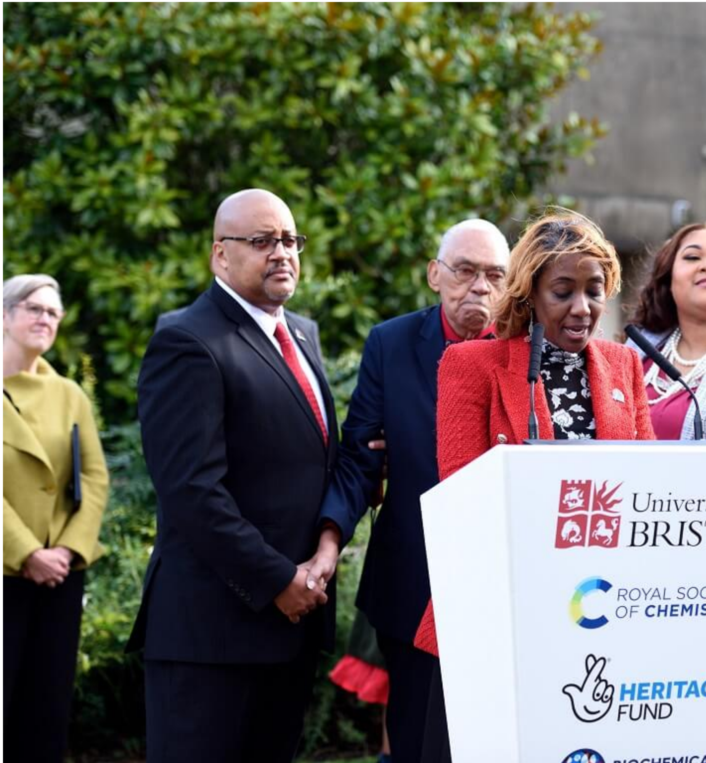
The Henrietta Lacks statue is unveiled by some members of the Lacks family.

The scientists who used Henrietta's cells in their research won awards and recognition, but rarely knew who she was. The continued use of the cells remains controversial, both inside and outside of the biomedical research community.