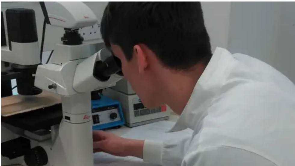
Using a microscope in the lab.

In-school and virtual learning sessions have engaged over 3,700 pupils, from reception class to Year 13, and adults. One teacher said: "There was a palpable buzz of excitement and curiosity around the room. You might have inspired some young people!"