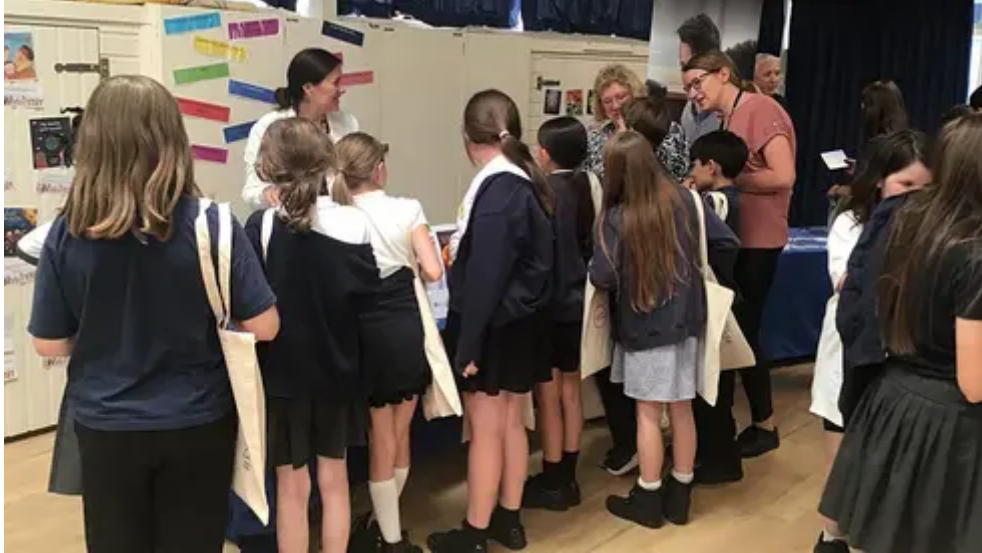
Activities engaged pupils of all ages.