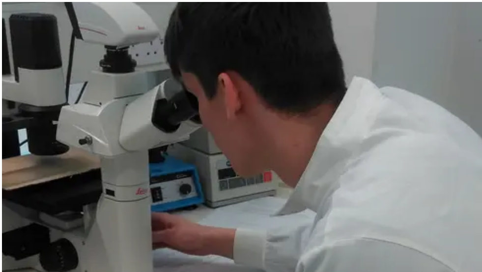
Using a microscope in the lab.

In-school and virtual learning sessions have engaged over 3,700 pupils, from reception class to Year 13, and adults. One teacher said: "There was a palpable buzz of excitement and curiosity around the room. You might have inspired some young people!"