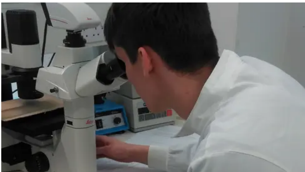
Using a microscope in the lab.

In-school and virtual learning sessions have engaged over 3,700 pupils, from reception class to Year 13, and adults. One teacher said: "There was a palpable buzz of excitement and curiosity around the room. You might have inspired some young people!"