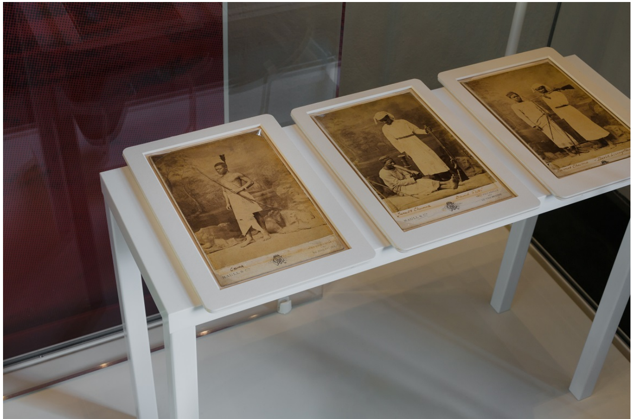
Staged photos of Susi and Chuma.