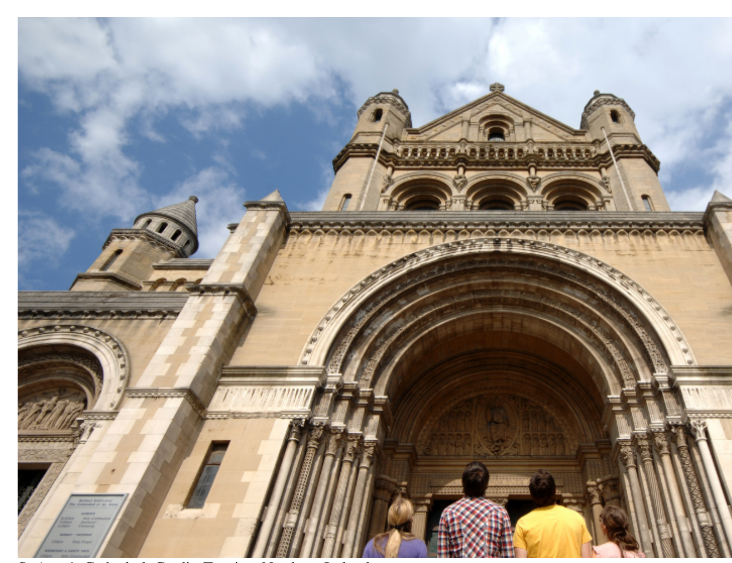
St Anne's Cathedral.

Great Place North Belfast's popular walking tour uncovers the unique heritage of a one-mile stretch of inner north Belfast.