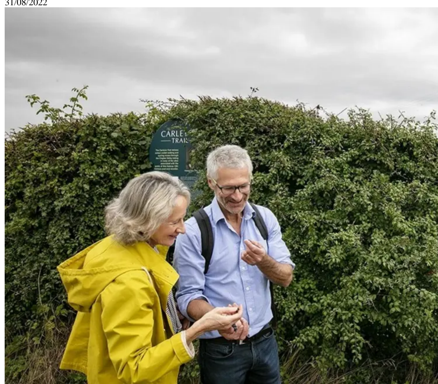
St Macartan's The Forth Chapel.

We've put together a list of five unmissable tours taking place during the European Heritage Open Days on 10–11 September – get out and explore your local heritage.