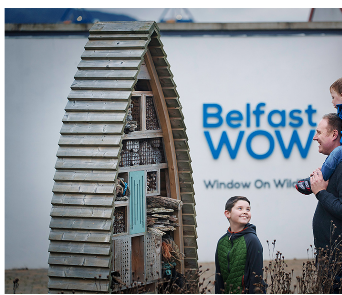
Belfast's Window on Wildlife.