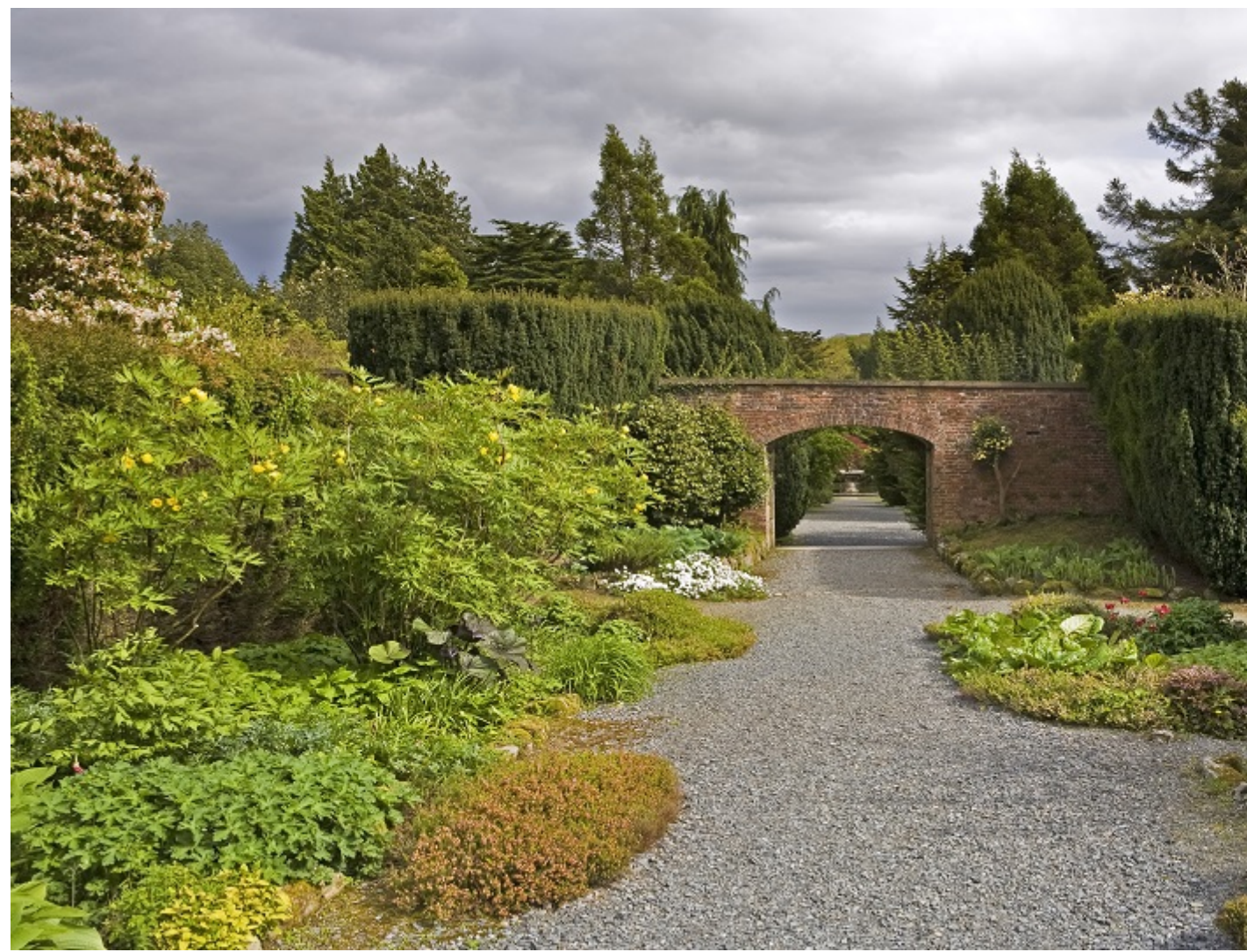
Castlewellan.

On Saturday and Sunday at 2pm, join a guided walk at the Arboretum and Garden at Castlewellan Historic Demesne. Since the 1750s, it has been home to one of the most significant collections of trees and shrubs in Ireland, featuring a number of 'champion trees' recorded as the largest or tallest of their kind.