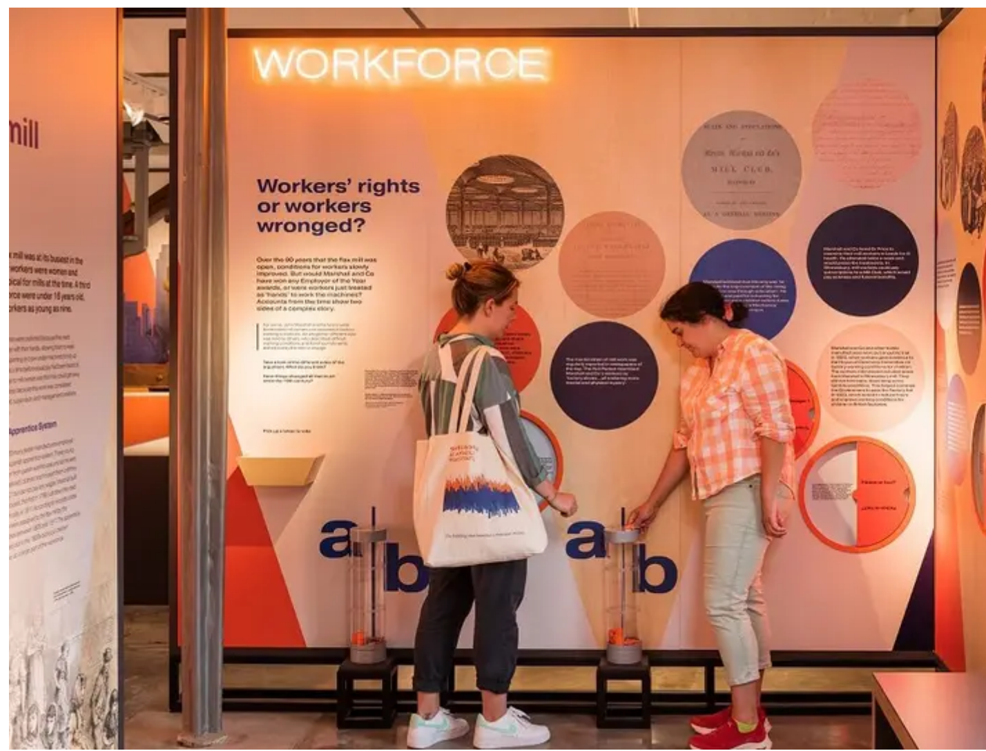
The new exhibition 'The Mill'.