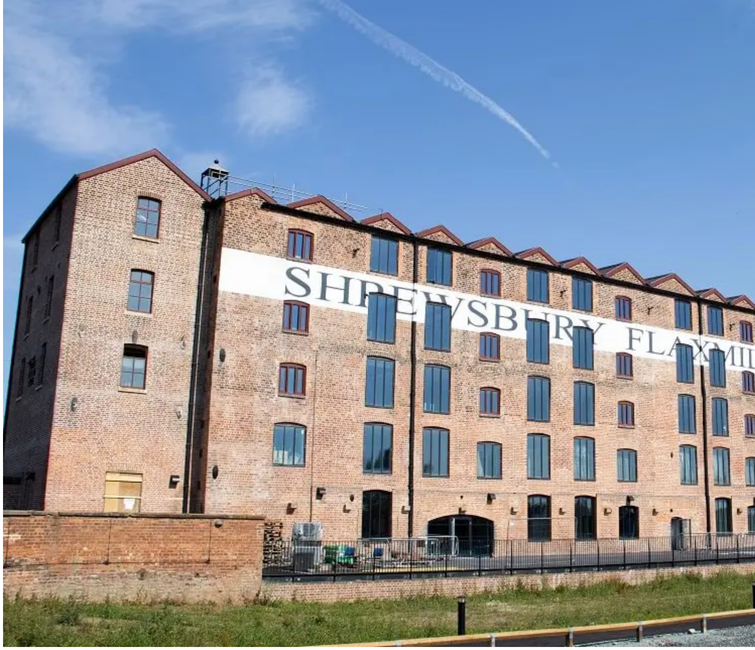
The historic Shrewsbury Flaxmill Maltings - the 'grandparent of skyscrapers' - has opened its doors again following 35 years of closure thanks to £20.7million National Lottery funding.

Four listed buildings on site are now fully restored: the Smithy, Stables, Main Mill and Kiln. Their redevelopment has been led by Historic England and The Friends of Shrewsbury Flaxmill.