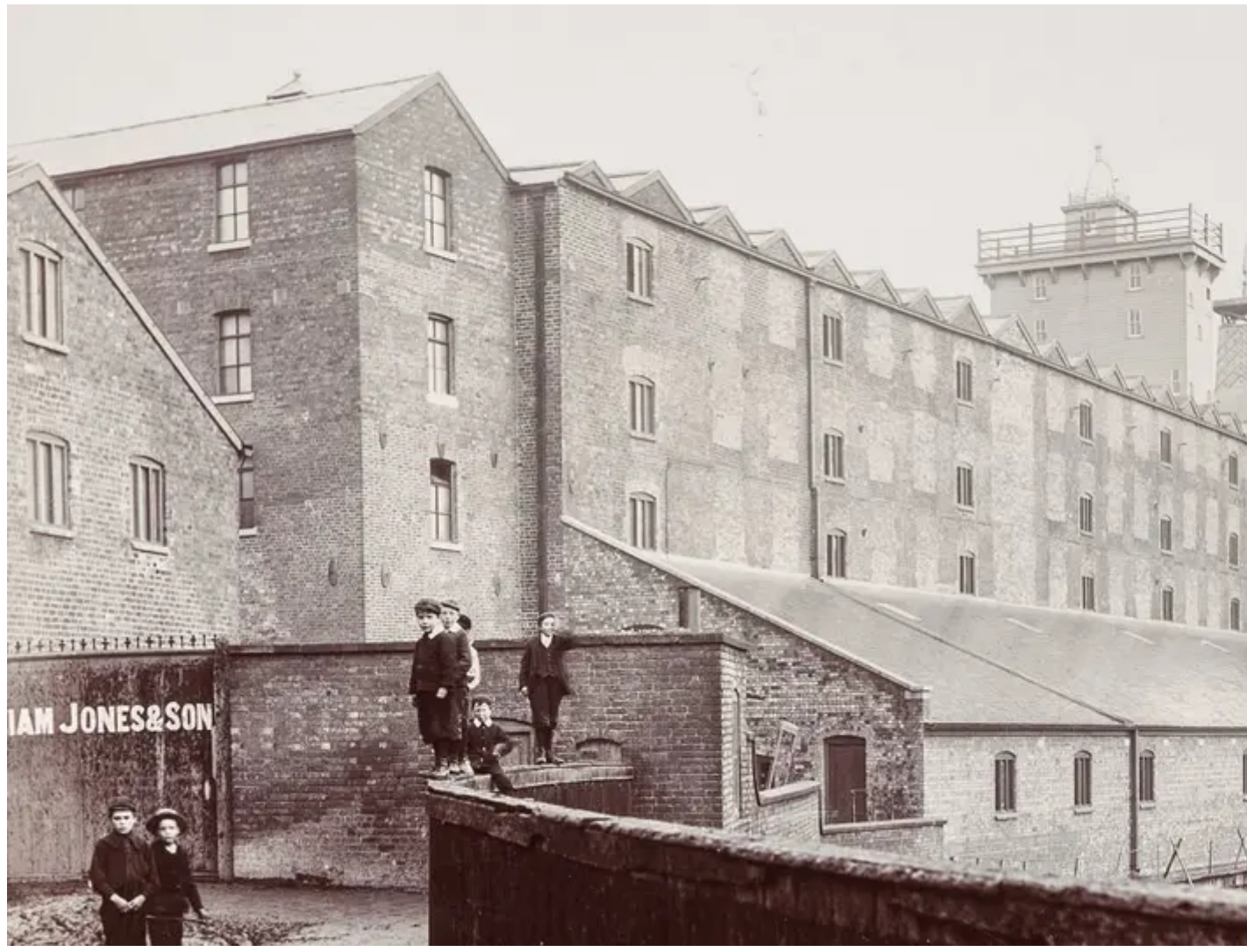
19th century image of the site after it had been adapted for use as a maltings.