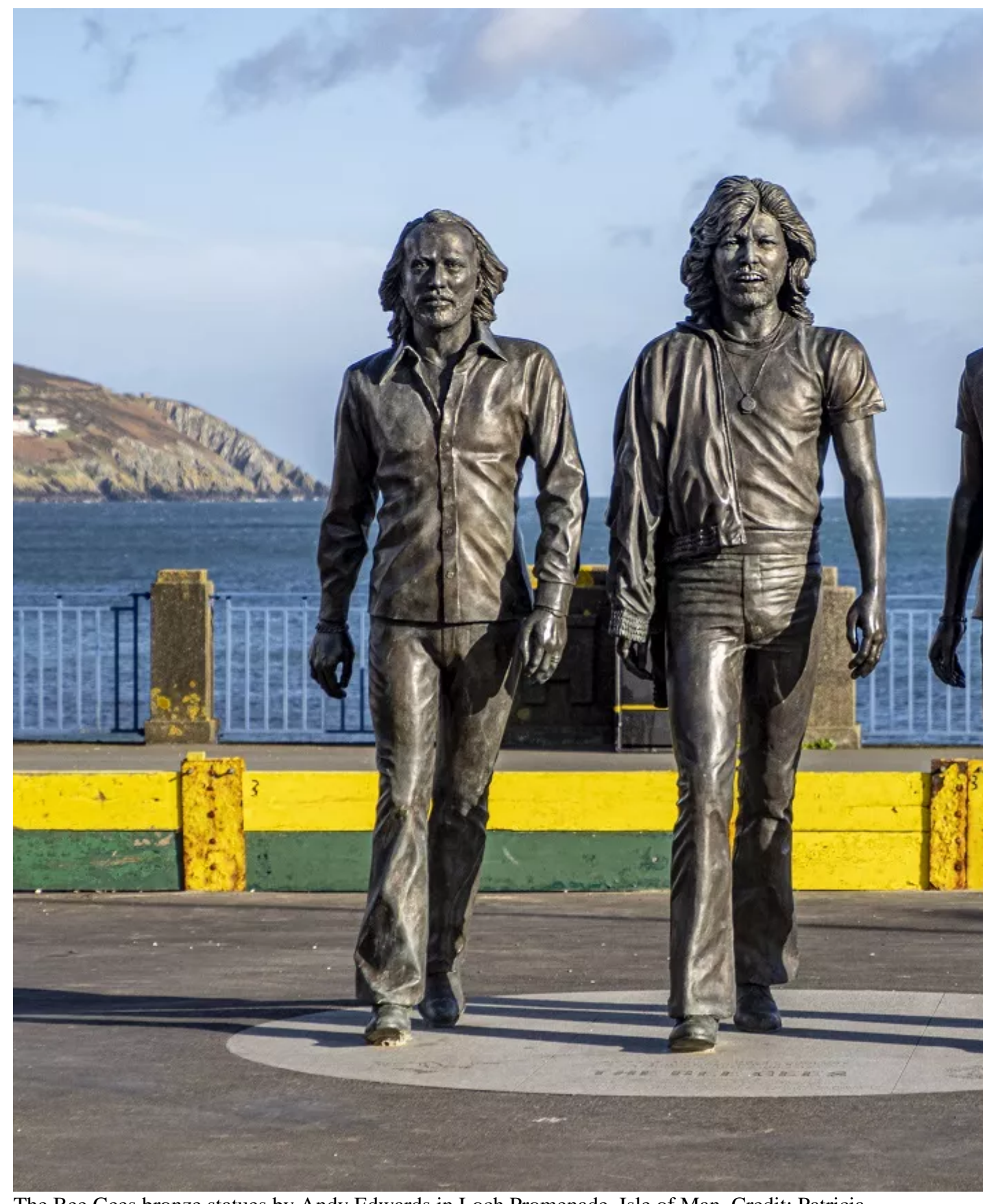
The Bee Gees bronze statues by Andy Edwards in Loch Promenade, Isle of Man.

Research also revealed some interesting facts about representation in the history of UK sculpture: