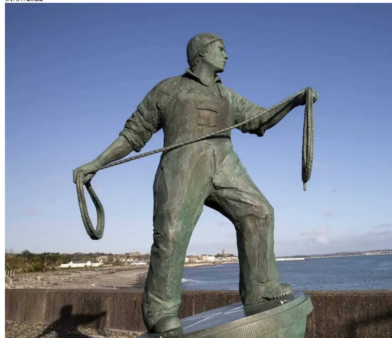
Newlyn Fisherman Memorial by Tom Leaper Promenade. The UK's significant collection of public sculptures is available to explore online for the very first time.

Art UK has photographed and digitised more than 36,000 sculptures on public display and held-in collections across the UK – and now you can see them all online.