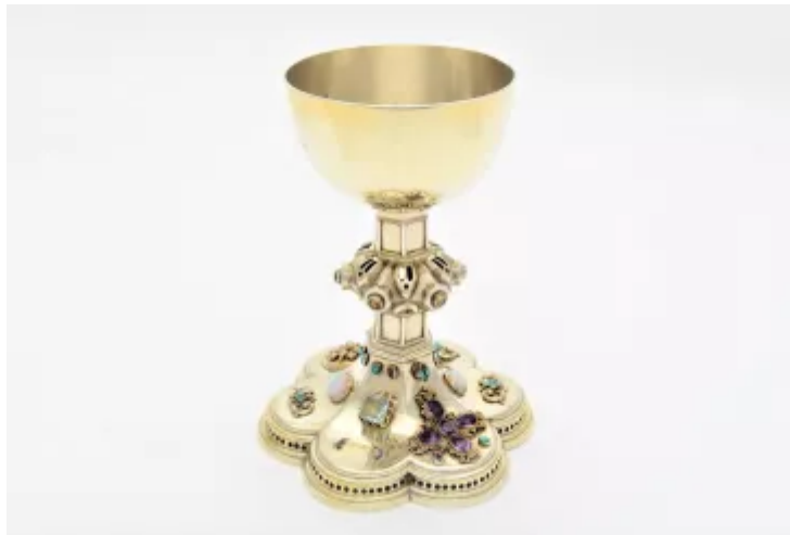
The missing jewelled chalice

Inside the Cathedral, digital guides and innovative interpretation will engage visitors in the fascinating stories and events which have shaped the building's history. People will have access to collections of archaeological artefacts, treasures, manuscripts and sculptures.