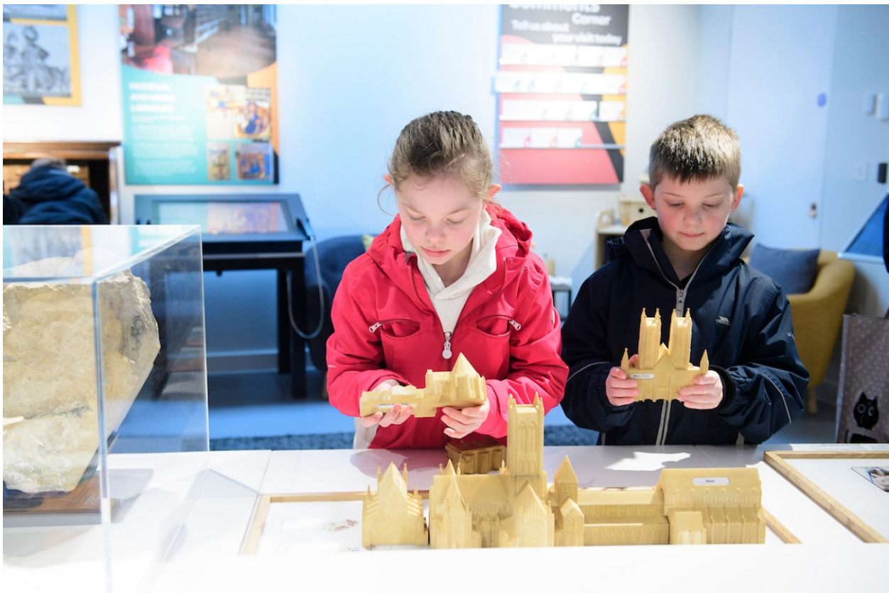
Interactive exhibitions for all ages

The Cathedral reopens on 4 July 2022, and it hopes the National Lottery-funded work will help it attract an extra 125,000 visitors a year.