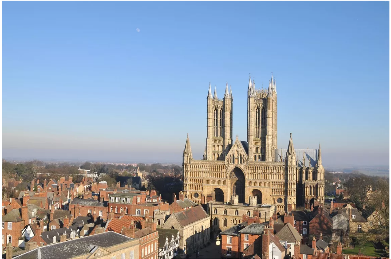
Lincoln Cathedral dominating the city skyline.