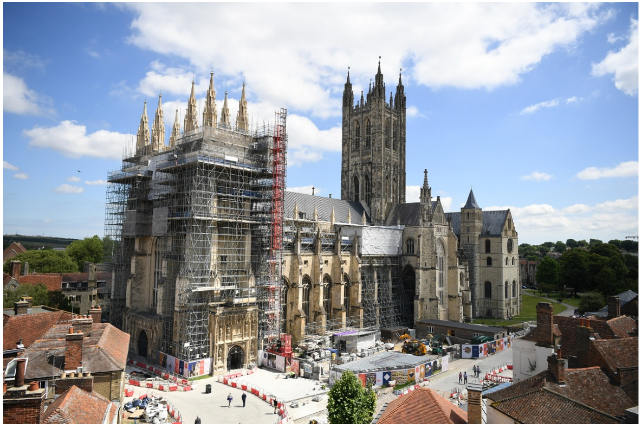
Canterbury Cathedral undergoing restoration

The Cathedral – which is a World Heritage Site, Scheduled Ancient Monument and Grade I listed structure – is open to the public throughout the summer. The Canterbury Journey Project is due to be completed in Autumn 2022.