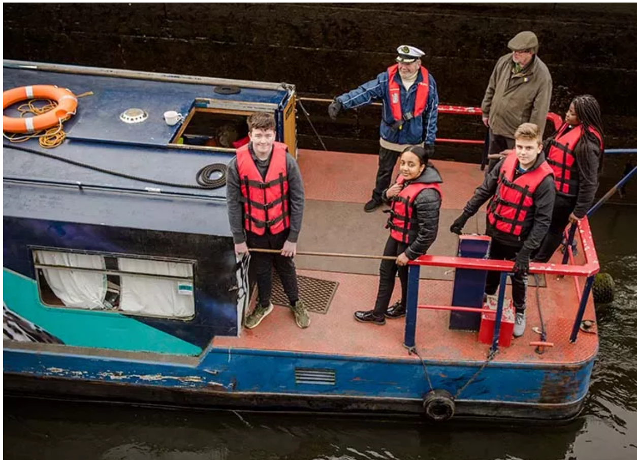
Young people enjoy a Canal Connections project.