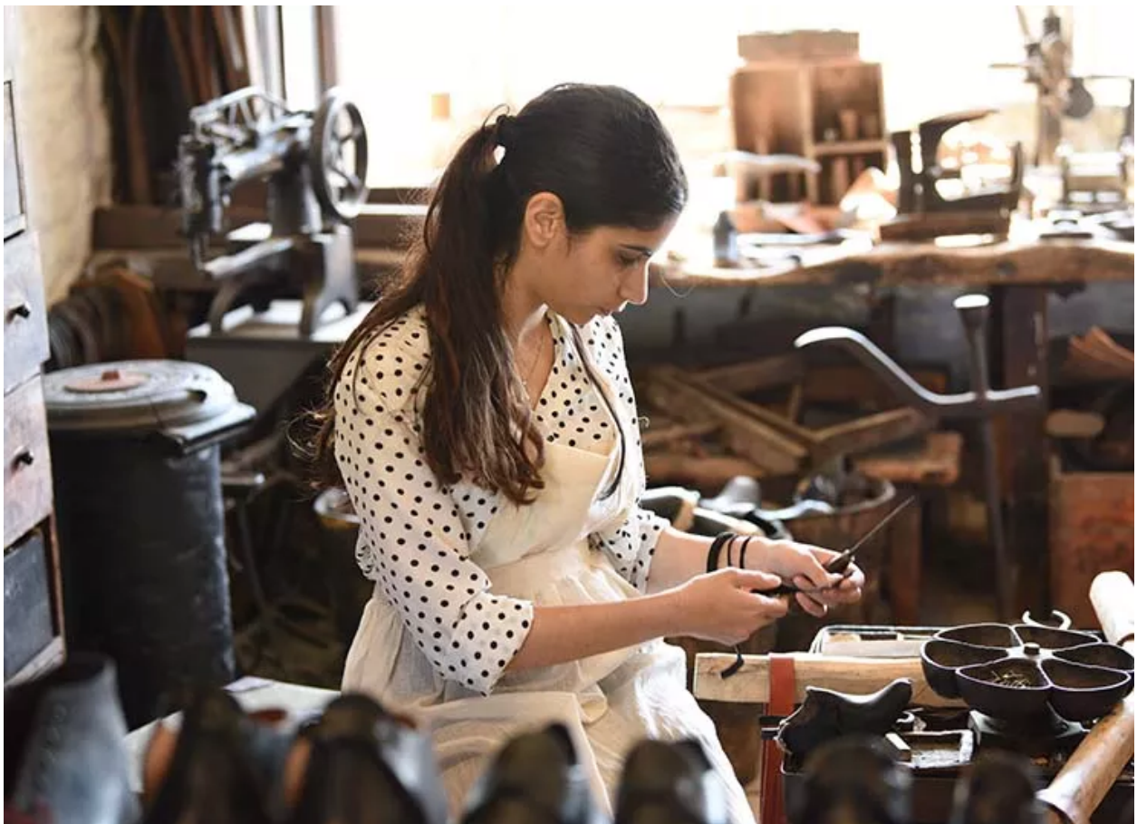
Taking part in the Made in Huddersfield project.

For some of the young people, due to the pandemic, they were not able to do their GCSEs. But we know that the experience they have had with us has helped them get into agricultural college or onto an archaeology degree, for example.