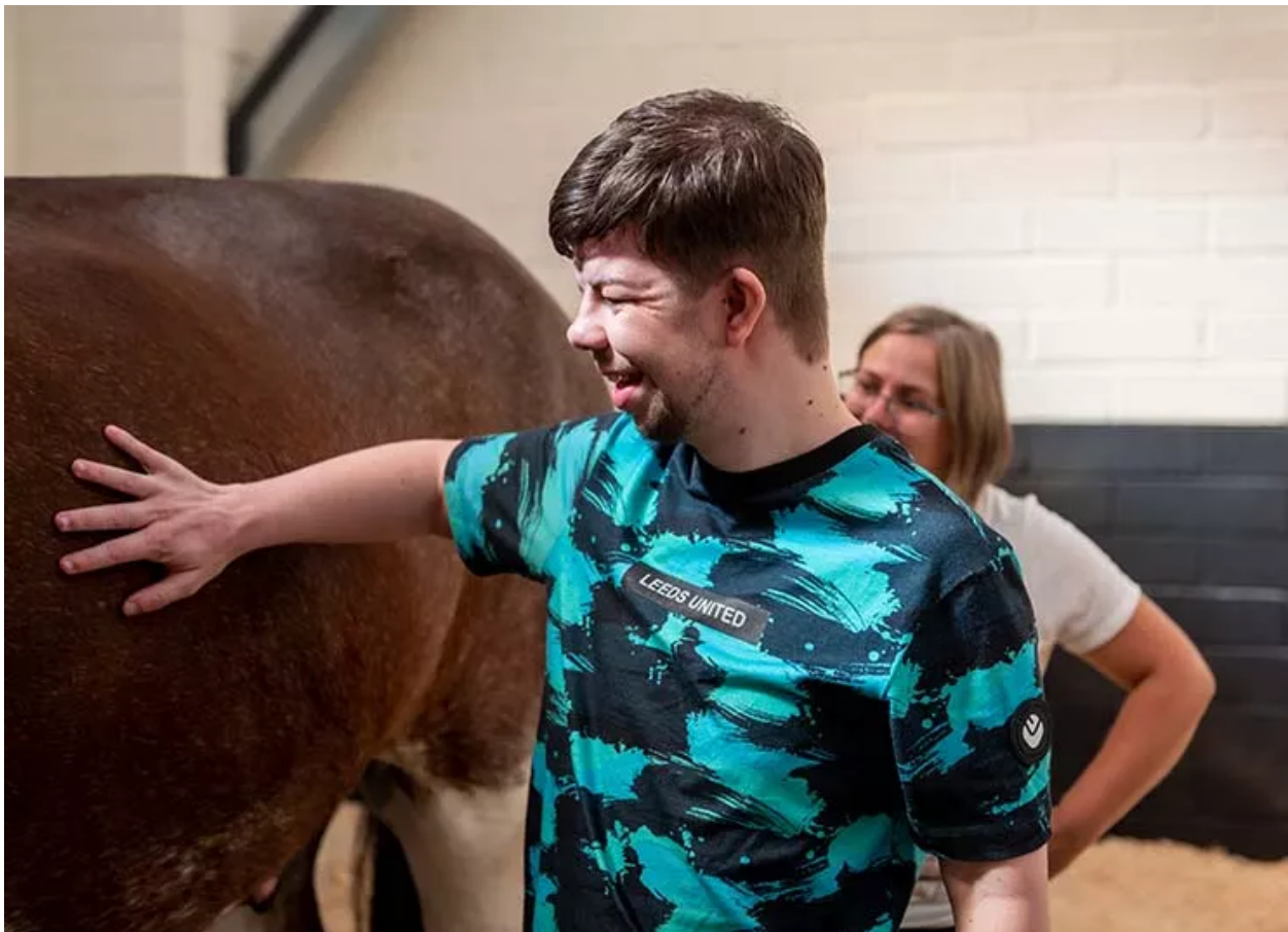
Visiting the National Coal Mining Museum.

The industrial heritage movement from the late 1960s onwards was prompted by the loss of industries that were large employers: the textile industry, coal mining, steam railways.