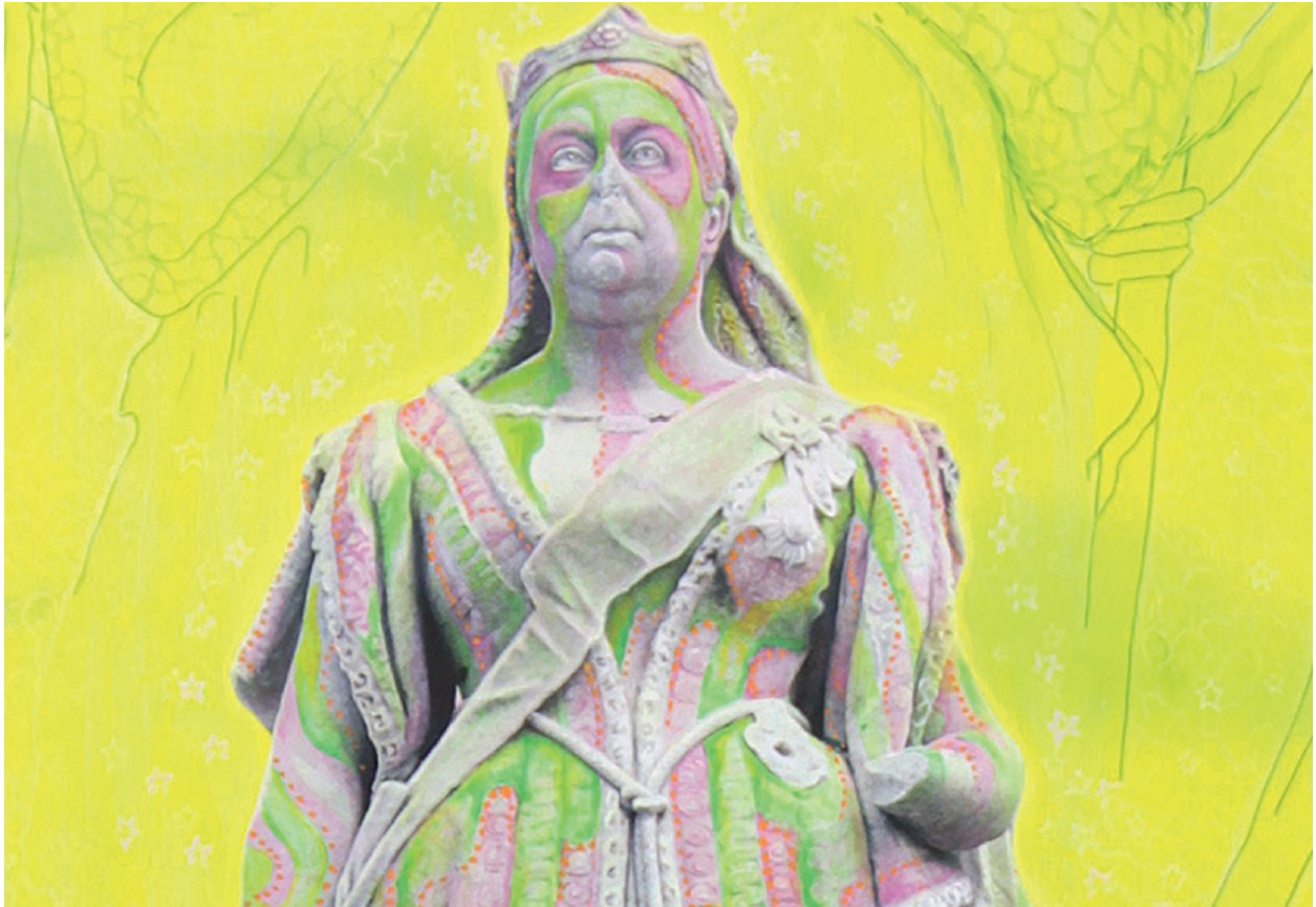
Queen Victoria sculpture.

Birmingham’s city centre sculpture of Queen Victoria will be reinterpreted by acclaimed British-Guyanese artist Hew Locke. His past work explores colonial and post-colonial power, through modification of existing artefacts such as coats of arms, trophies and public statuary. The artist’s interest in the power of statues originated from his childhood in Guyana where he passed a sculpture of Queen Victoria every day on the way to school.