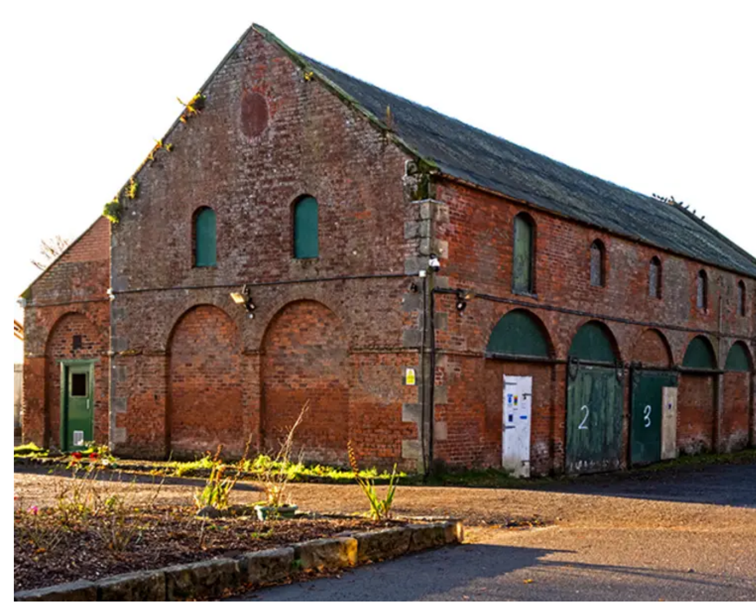
The much-loved mill is at the centre of a five-year project, set to receive £3.47million from the Heritage Fund.

A derelict mill near Leven in Fife is to be brought back to life thanks to funding from National Lottery players, with people's physical and mental wellbeing at the centre of the project.