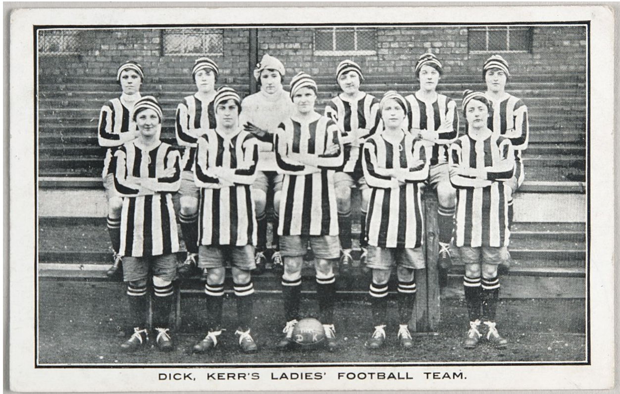
Dick, Kerr Ladies, formed in Preston, 1917.

In a year which also marks 141 years since the women's England team first played competitively , the project will challenge the perception of football being 'new' for women and improve how the sport is understood.