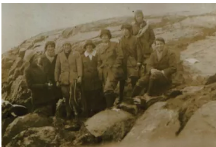
The Pinnacle Club's first meeting in 1921

National Lottery funding has helped projects share the heritage and unheard voices of many sports across the UK. Recent examples include: