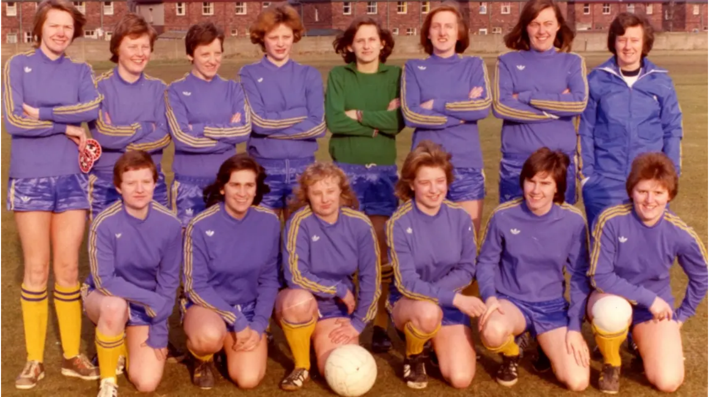
St Helens WFC, 1977.

As England prepares to host the UEFA Women's EUROs this summer, a National Lottery funded project will tell the stories of the country's female pioneers of the game.