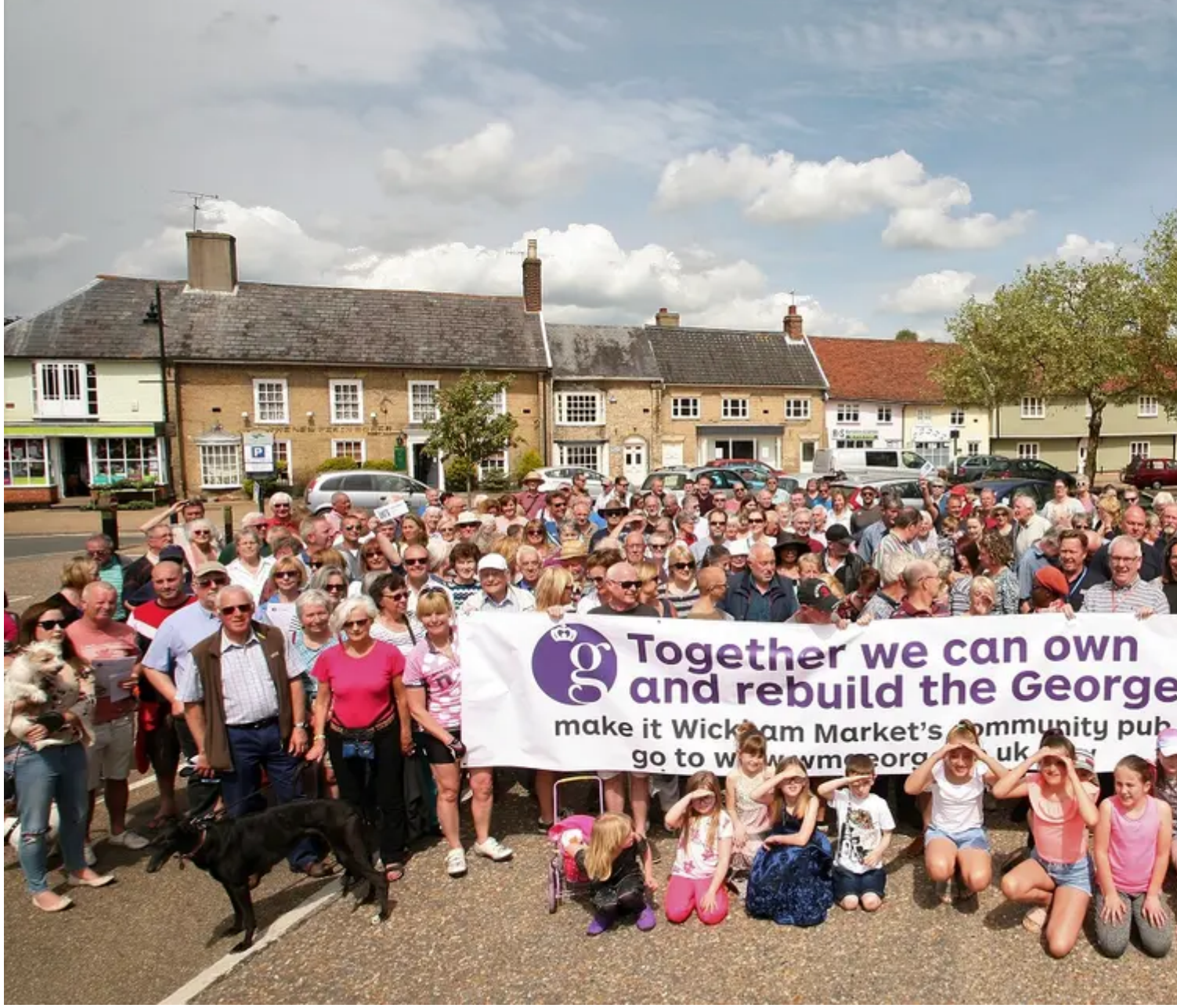
Wickham Market's community saving The George Community Pub. A grant of £988,200 has been awarded to The George pub in Wickham Market, Suffolk ?– a Grade II listed building which will serve as a thriving community hub.

The Heritage Enterprise grant has been awarded to conserve and restore this historic building, which has been closed since a major fire in 2013.