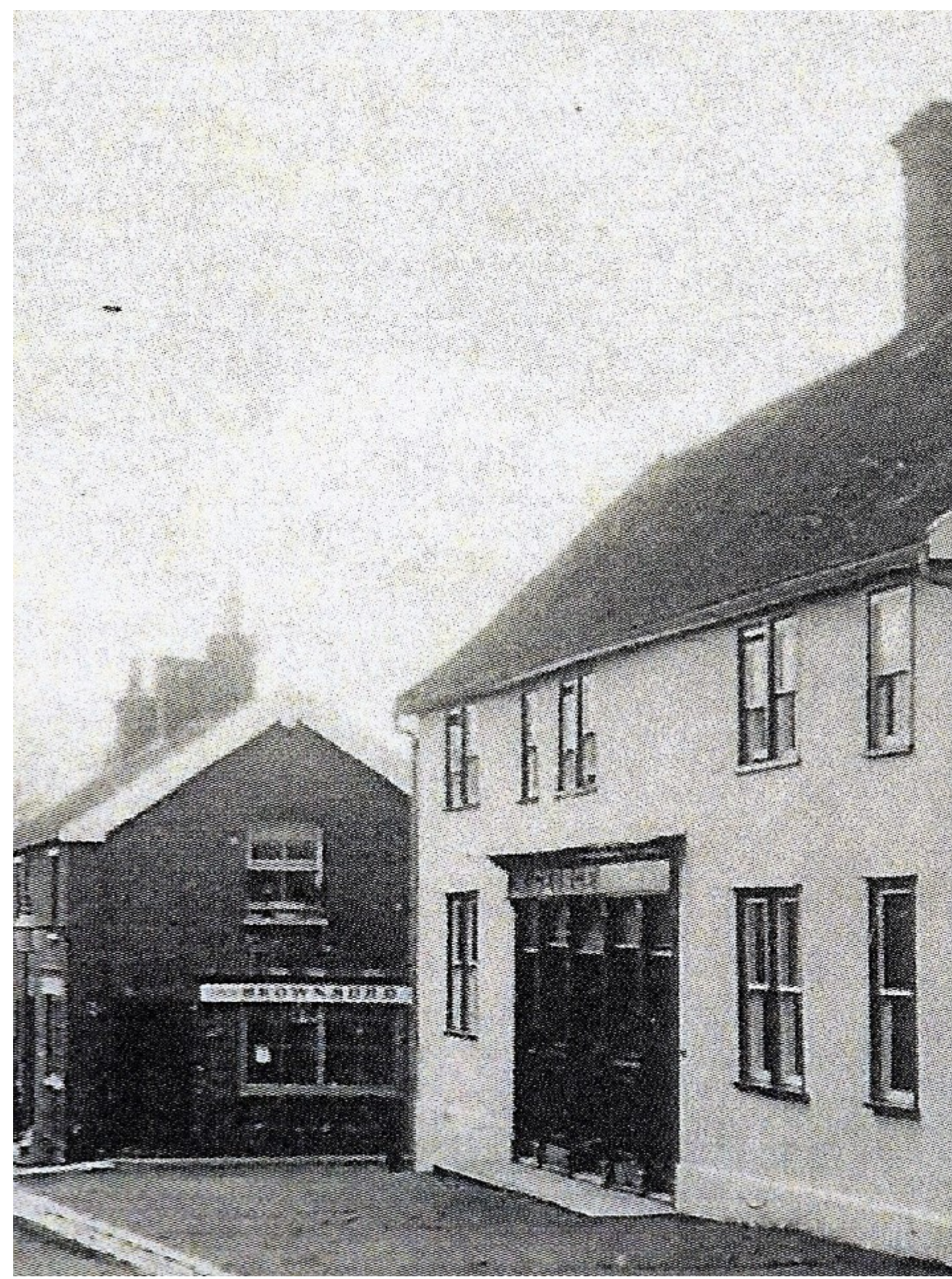
Old photograph of The George pub from the 1920s.