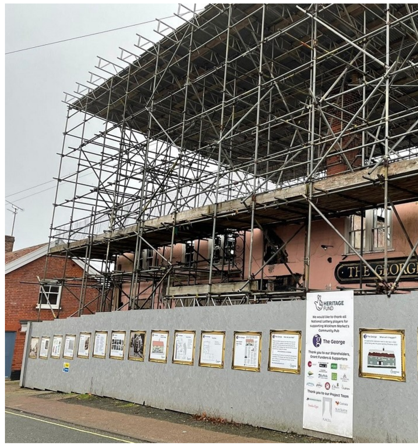
Scaffolding outside the pub to prepare for construction.

Alongside this, a programme of wellbeing activities will be developed in association with Wellbeing Suffolk and local community groups. Programmes in development include support for people living with dementia or loneliness, ensuring they will have a safe, inclusive place in which to meet and socialise in a post-lockdown world.