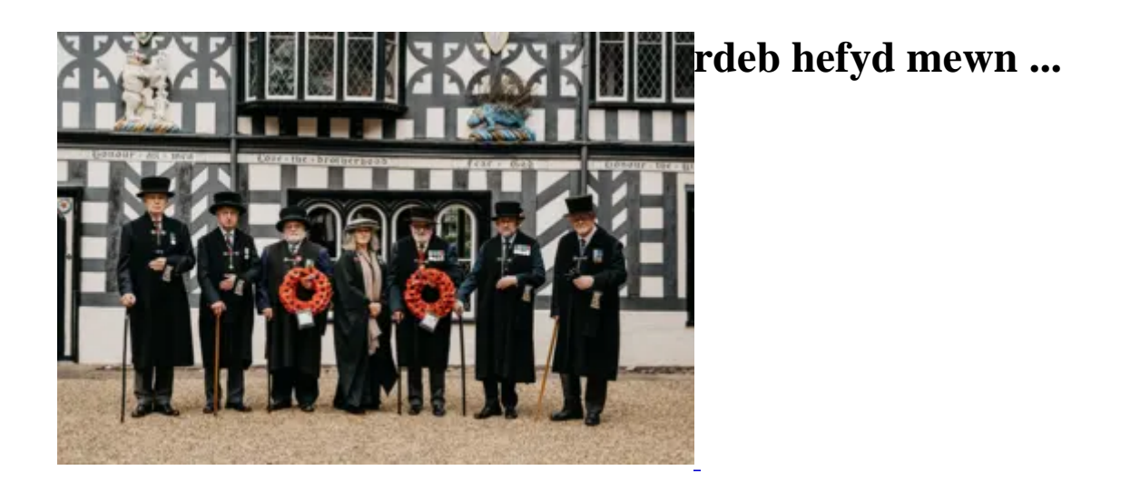
The current Lord Leycester Brethren.

We fund heritage projects large and small, providing grants from £3,000 up to millions of pounds. Take a look at our funding programmes and decide which one might be right for you.