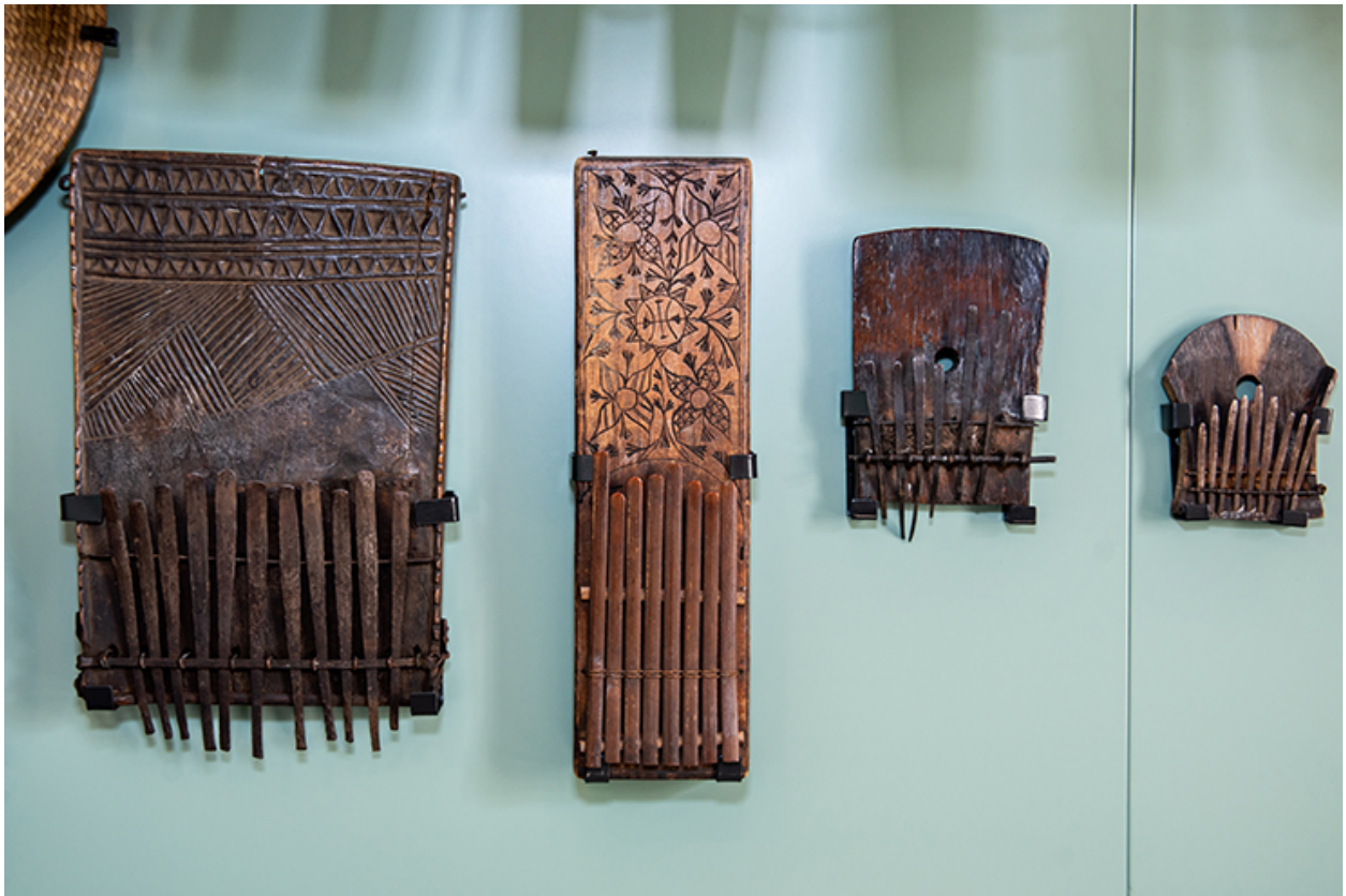
A selection of Southern and Central African objects on display in the museum.

Visitors will also be able to view a new video series produced in partnership with the Scotland Malawi Partnership. The series examines Livingstone's ongoing legacy and how it relates to faith, anti-racism, the story of Africa and his impact on colonialism.