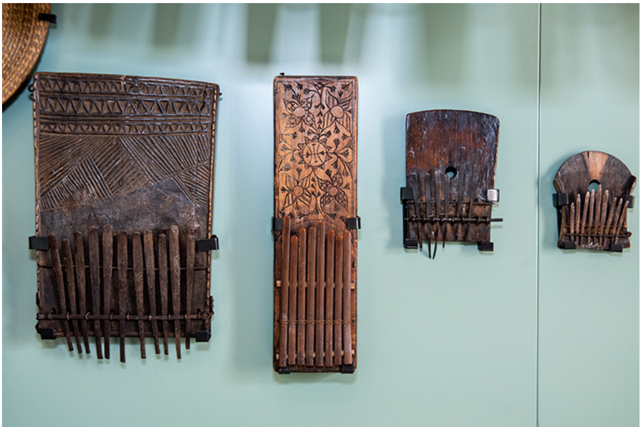
A selection of Southern and Central African objects on display in the museum.

Visitors will also be able to view a new video series produced in partnership with the Scotland Malawi Partnership. The series examines Livingstone's ongoing legacy and how it relates to faith, anti-racism, the story of Africa and his impact on colonialism.