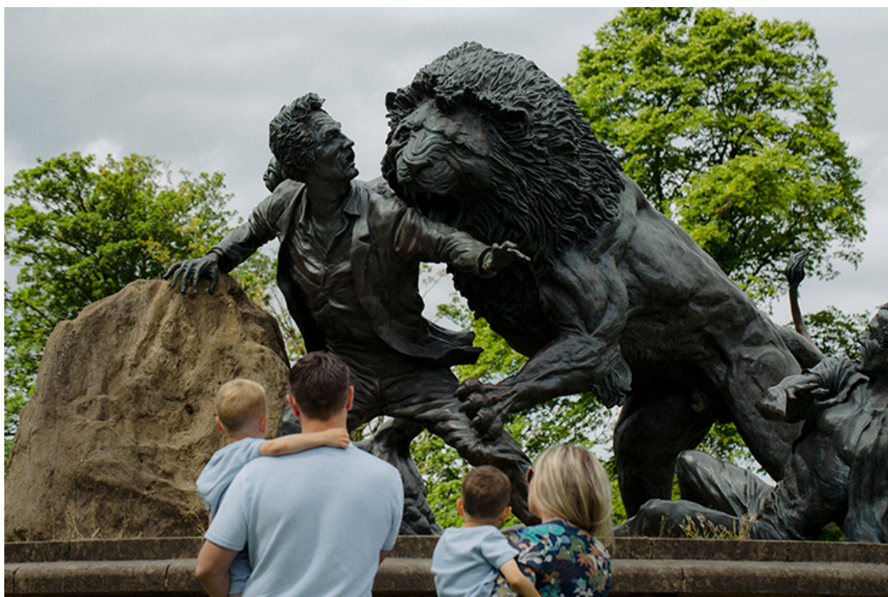
Livingstone and Lion sculpture depicting a lion attack Livingstone experienced in Southern Africa.

"The tenacity and resilience of the Trust in driving this world-class heritage project through the challenges of the pandemic should be applauded, and we are delighted the Birthplace is now open."