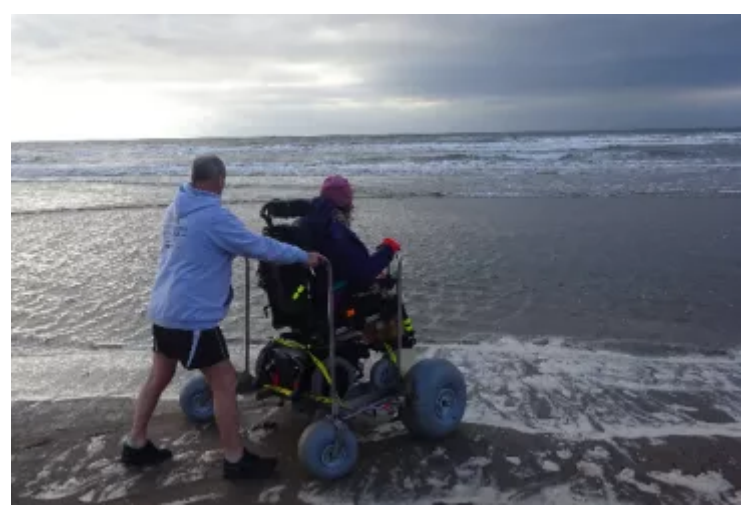
Garnock Connections Landscape Partnership