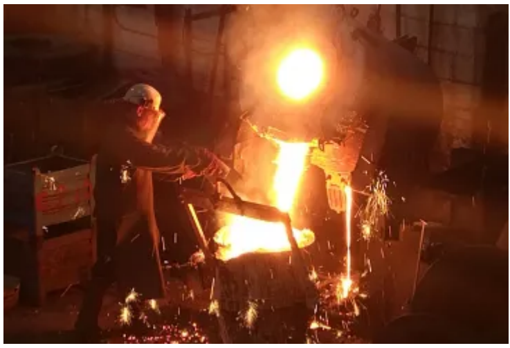
Smelting at Loughborough Bellfoundry.

Committee members with experience of the following are particularly sought: