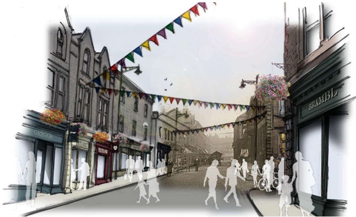
Artists impression of the regenerated town centre