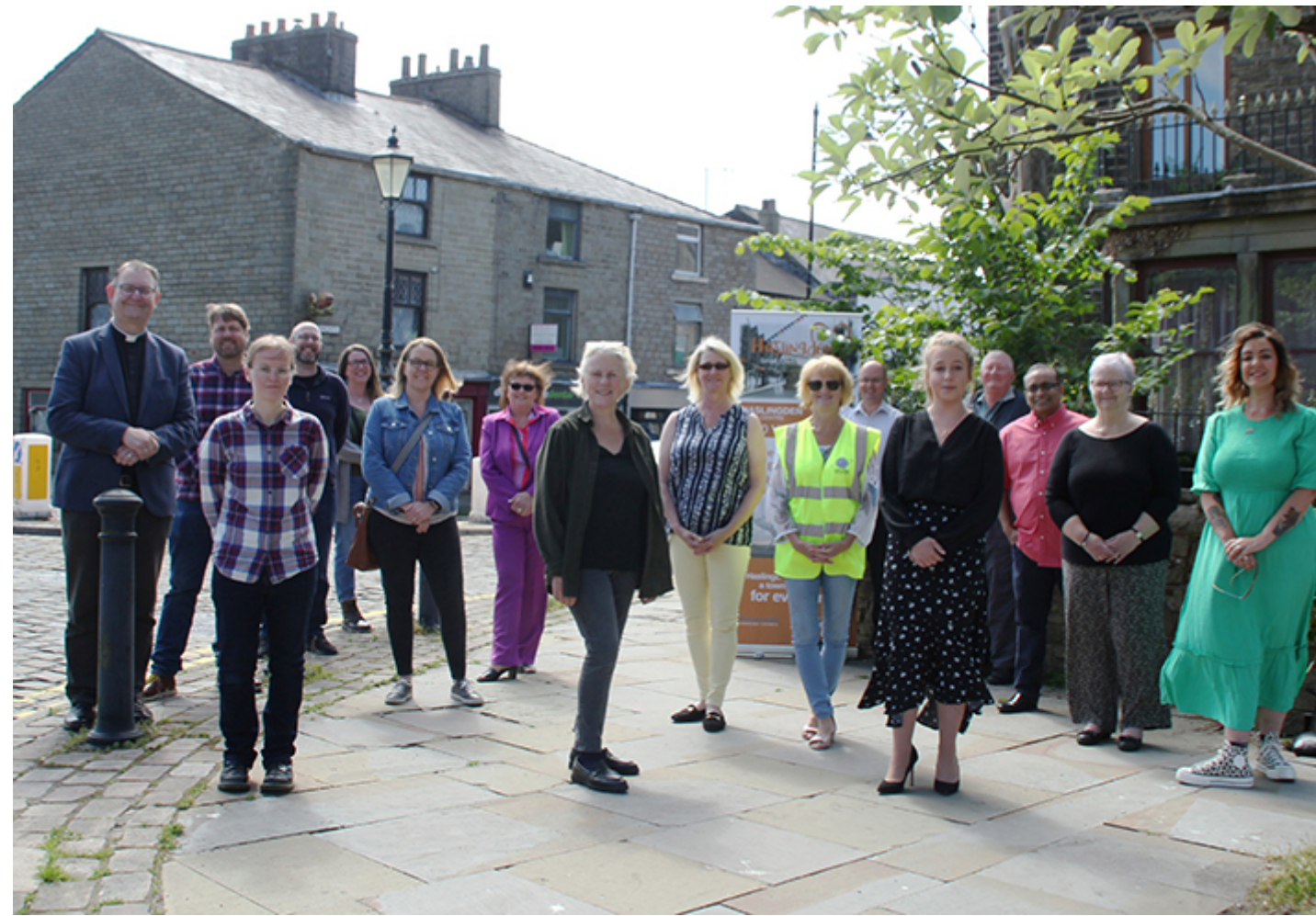
The Big Lamp team.