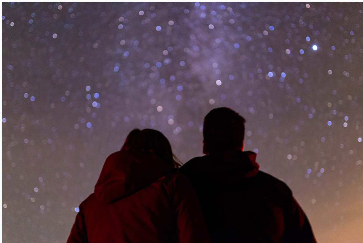
The Kielder Observatory received a grant of £23,300 in the second round of the Culture Recovery Fund.