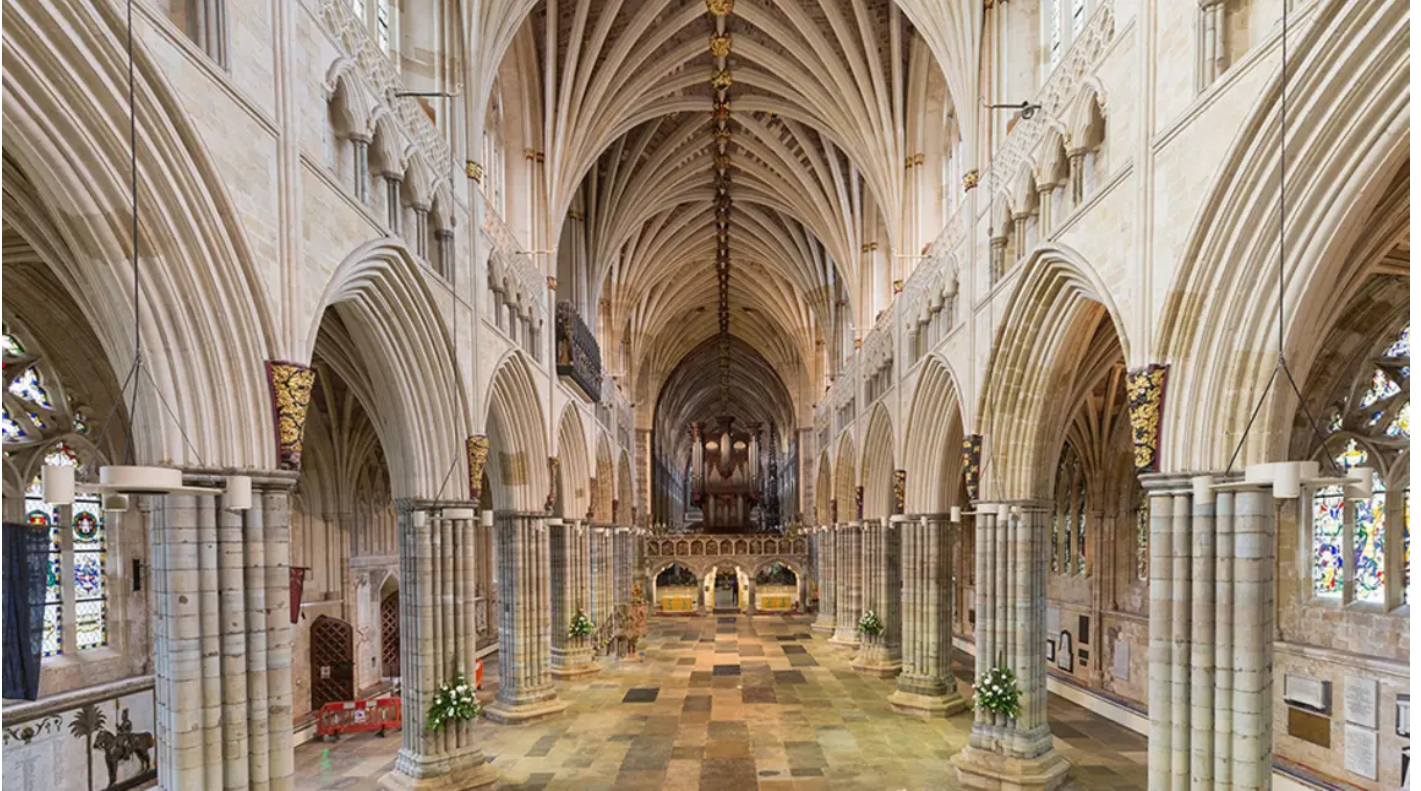
Exeter Cathedral.

A third round of the Government's Culture Recovery Fund - supporting heritage organisations in England – is now open.