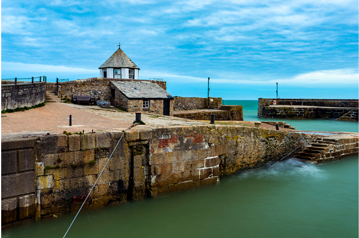
Charleston Harbour was awarded £109,500 of support from the second round of the Culture Recovery Fund

The first strand, Emergency Resource Support, is open to heritage organisations in England whose livelihoods are threatened by the ongoing impact of the pandemic. Grants of between £10,000-£1m are available.