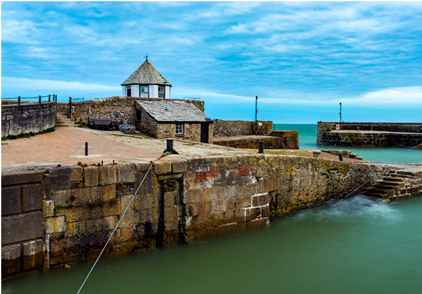
Charleston Harbour was awarded £109,500 of support from the second round of the Culture Recovery Fund

The first strand, Emergency Resource Support, is open to heritage organisations in England whose livelihoods are threatened by the ongoing impact of the pandemic. Grants of between £10,000-£1m are available.