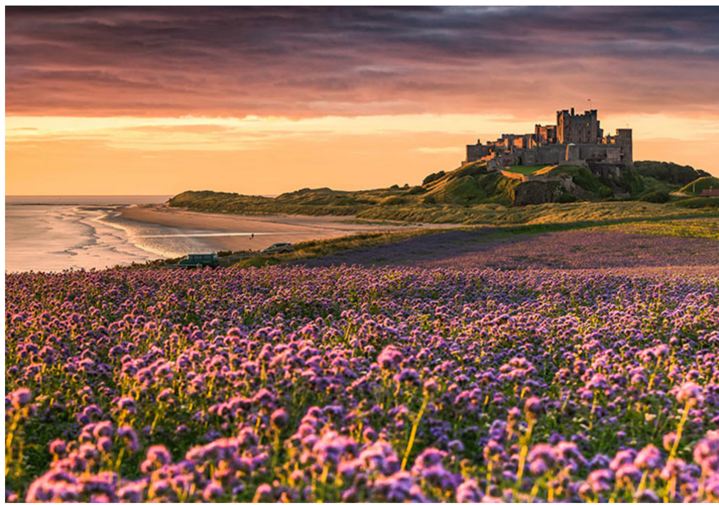
£137,400 has been awarded to Bamburgh Castle

"Now we're staying by their side as they prepare to welcome the public back through their doors – helping our cultural gems plan for reopening and thrive in the better times ahead."