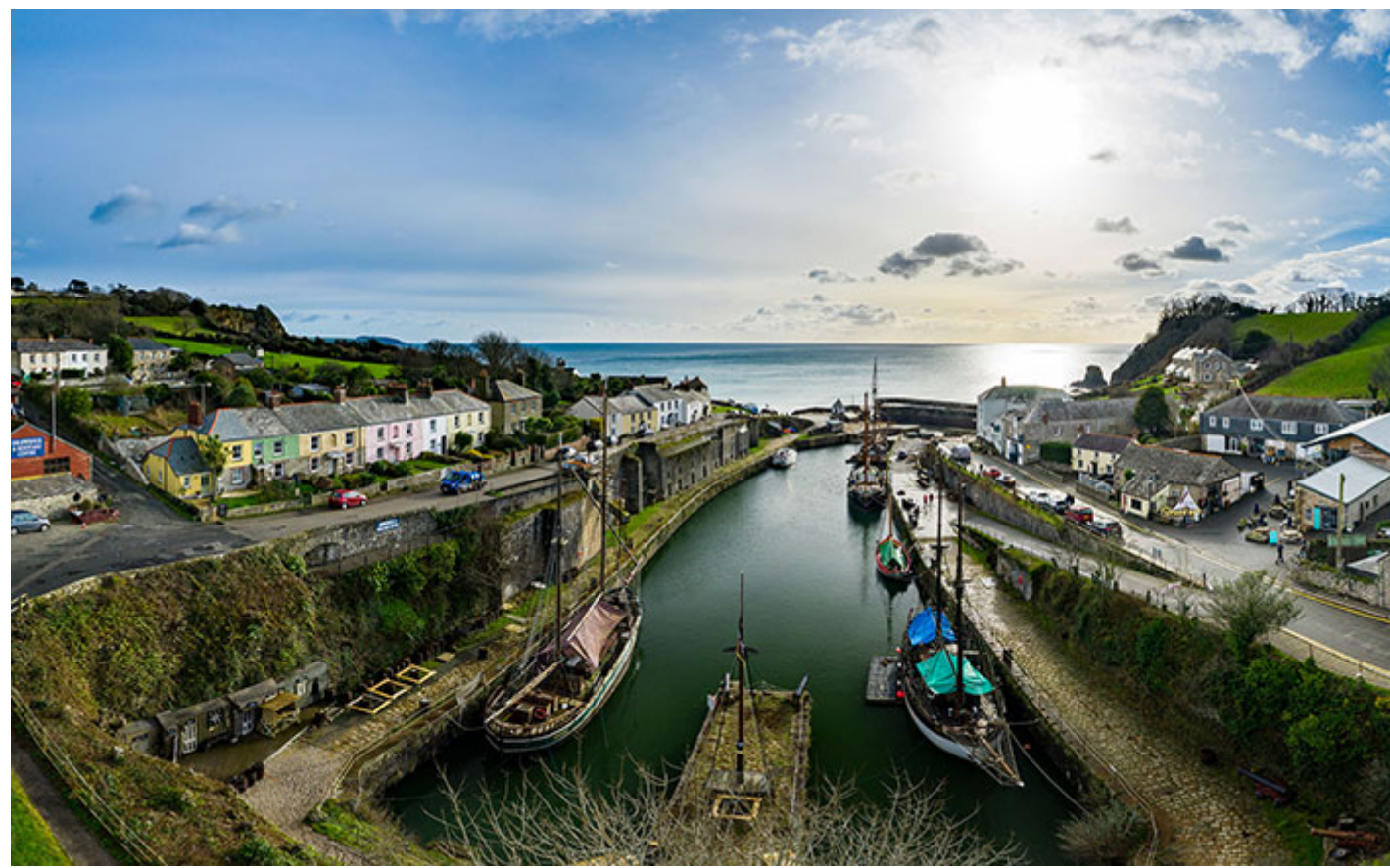
Charlestown Harbour received £109,500 from the Culture Recovery Fund

It builds on more than £146m delivered to the sector in the first round of the Culture Recovery Fund, which included funding for revenue and capital works.