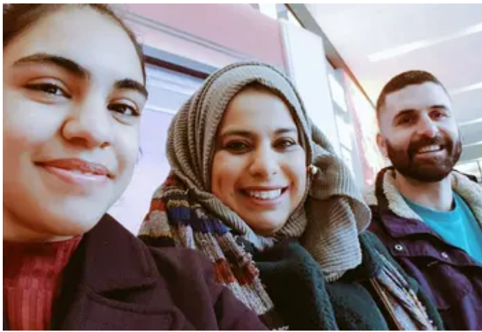
ddordeb hefyd mewn ...