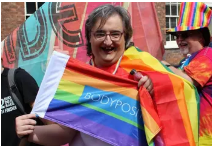
nks to emergency funding