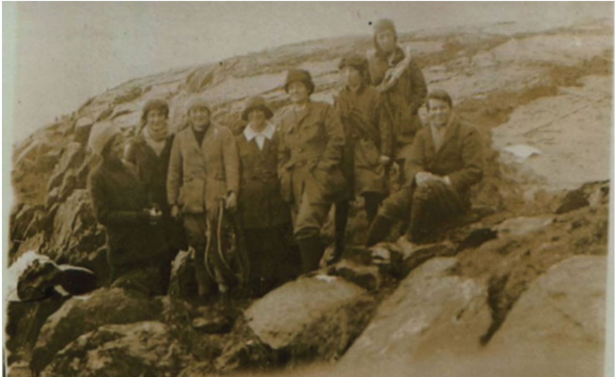
The Pinnacle Club's first meeting in 1921

Climbing provides an opportunity to get close to nature, and has incredible mental wellbeing and physical health benefits. The club hopes the series of blogs will inspire people of all backgrounds and ages, particularly women, to see how climbing can offer escapism from their everyday lives and build a stronger connection with our natural heritage.