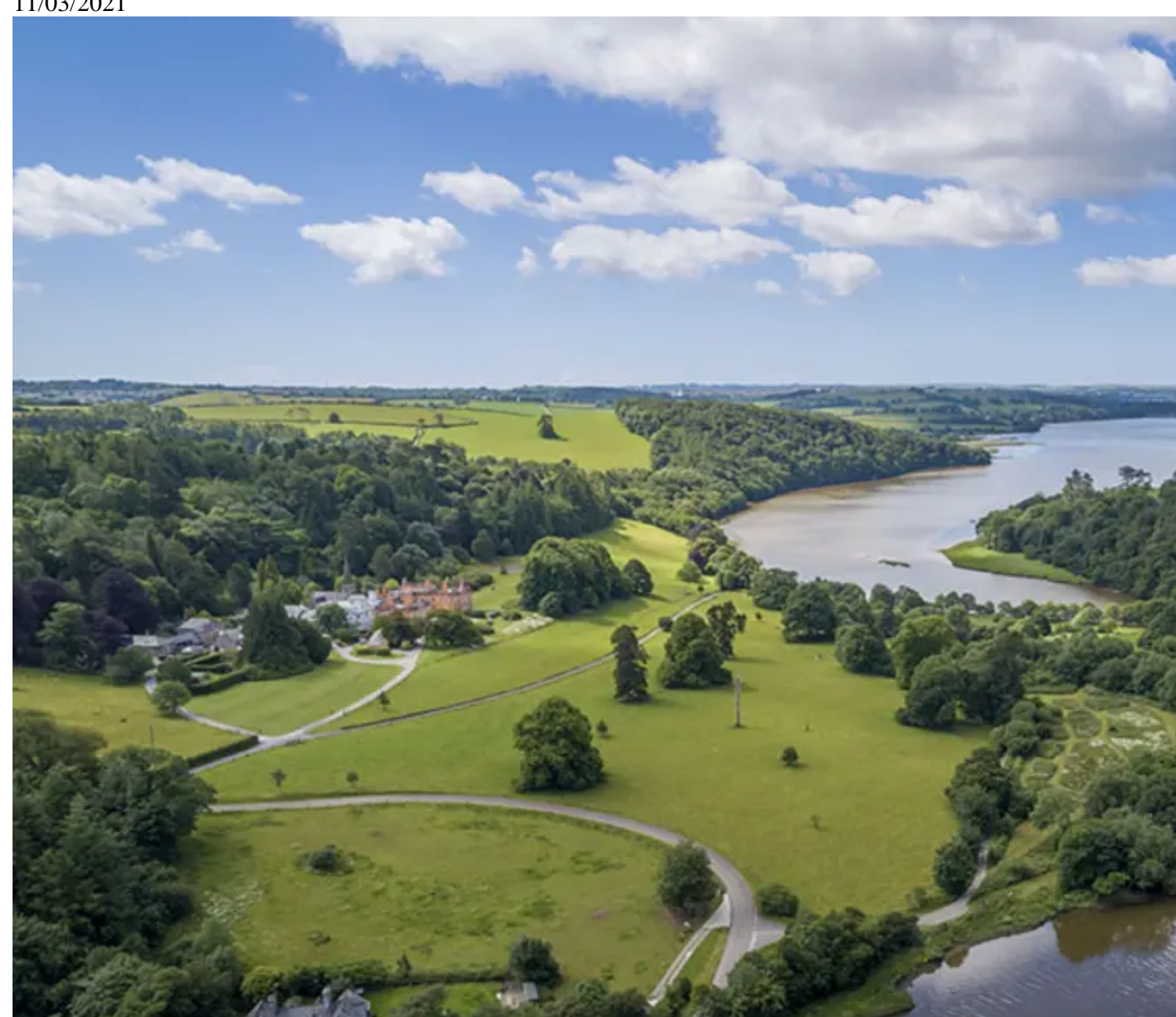
Thanks to National Lottery players, an ambitious five-year project will provide a brighter future for the Tamar Valley and its communities.

A hidden gem along the Devon and Cornwall border, the stunning Tamar Valley is a landscape at risk.