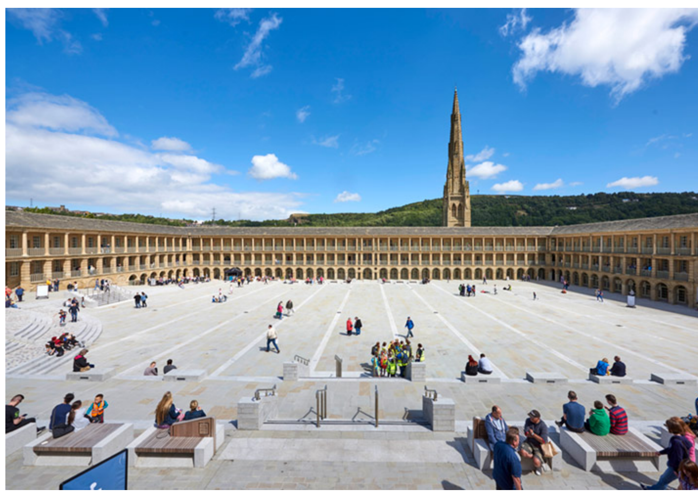
The Piece Hall, Halifax