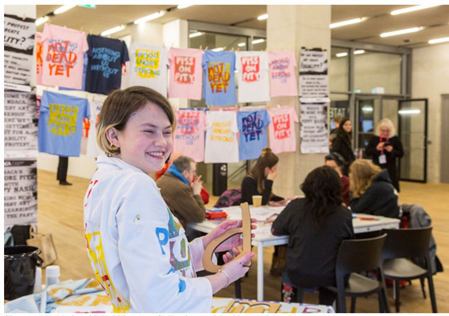
Shape Arts - National Disability Arts Collection and Archive project