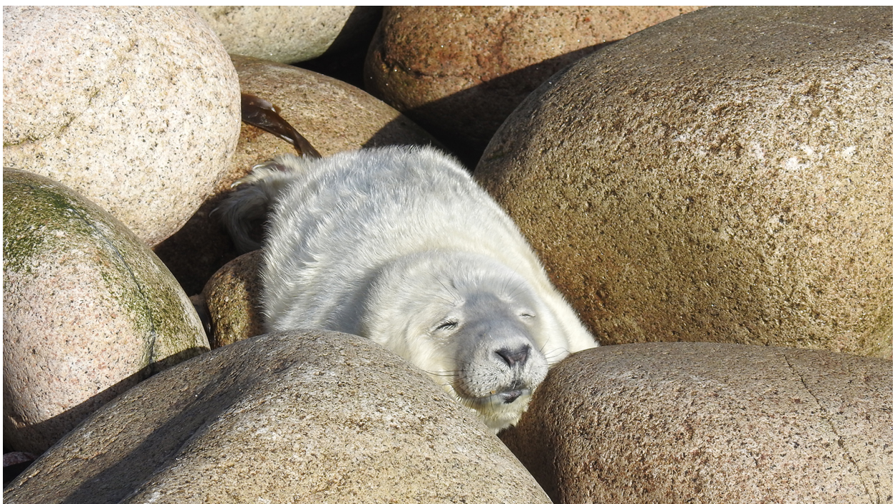
Grey seal pup

The UK is home to 34% of the world's grey seals. The Cornwall Seal Group Research Trust – mainly supported by volunteers – has received £75,700 to train community citizen scientists to undertake valuable research. They will raise awareness with local residents and tourists on how to 'watch seals well'.