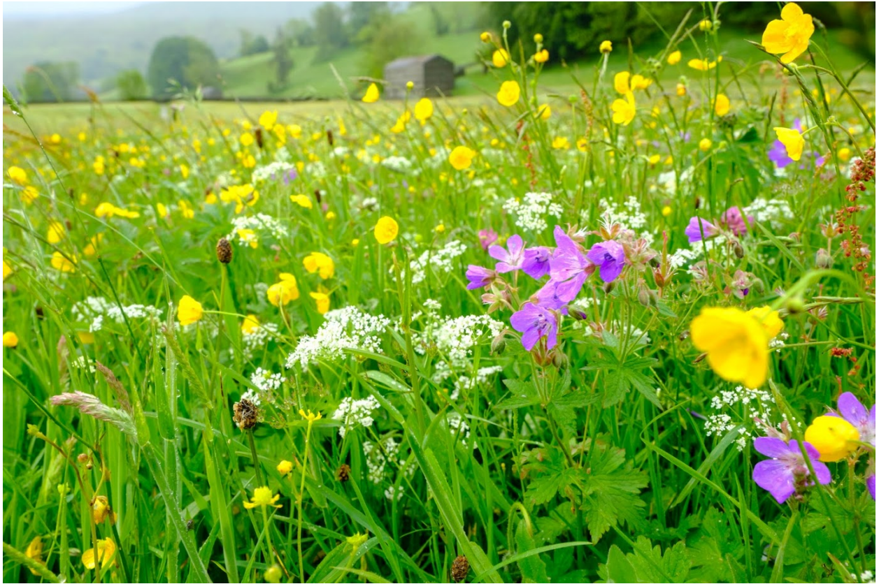
Muker Meadows.