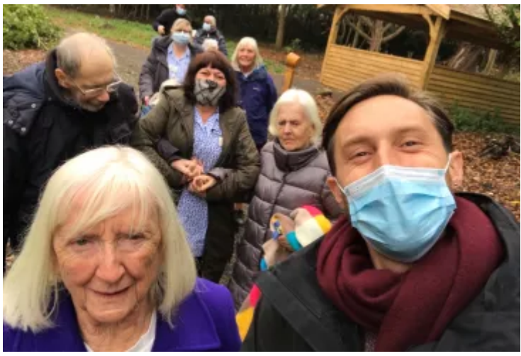
Wilderness project group selfie

British Sign Language was her first language. People often don't realise that English is a second, and often less familiar, language for many Deaf people.