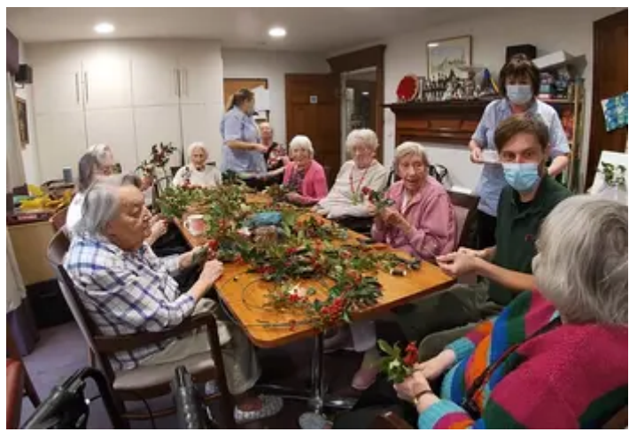
The Wilderness project

A phrase we use that comes to mind is 'do nothing about us without us'. It's so important to learn from disabled people themselves and understand differing needs.