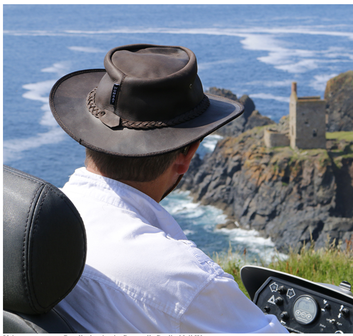
Using a tramper at Botallack mine in Cornwall.

For Living Options Devon the pandemic has highlighted the importance of digital and the part it plays in keeping heritage accessible – although people have to be aware of the issues around <u>digital accessibility</u> to make sure disabled people are included.