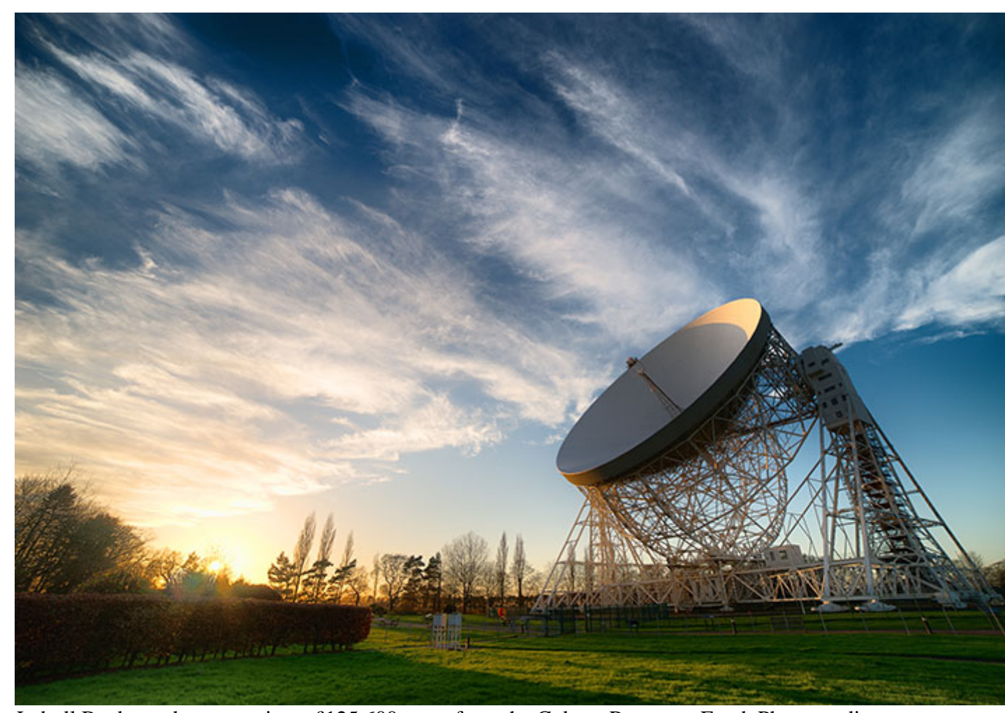
Jodrell Bank are due to receive a £125,600 grant from the Culture Recovery Fund.

Grants between £10,000 and £1 million have been awarded to stabilise 77 organisations. Sites include Jodrell Bank Discovery Centre in Macclesfield, which will receive £125,600 to develop digital activity to reach an online audience unable to visit in person.