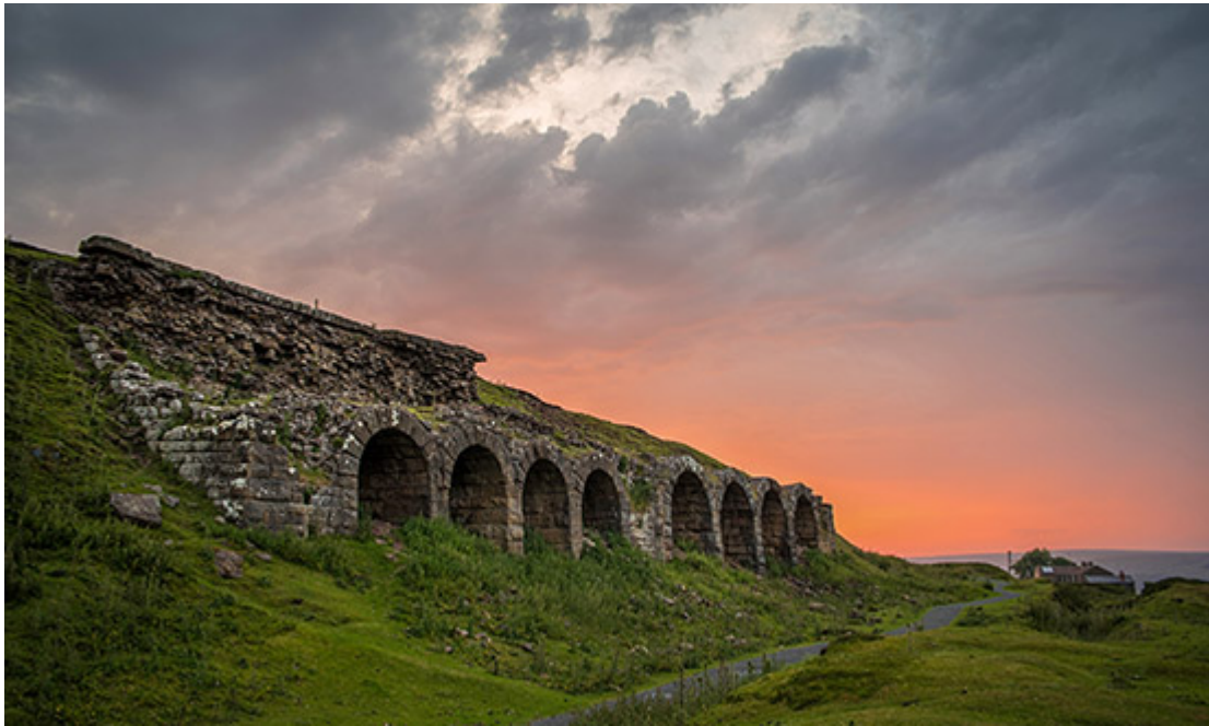
Rosedale Bank Top, North Yorkshire.

As well as improving the condition of iconic industrial features from the ironstone industry, the Land of Iron Landscape Partnership ensured that the historic monuments were recorded and conserved and that stories from this significant part of England's heritage were told.