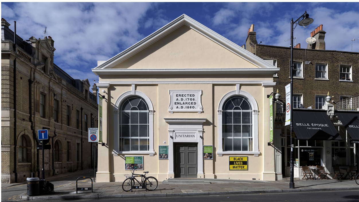
Newington Green Meeting House, Hackney.

With funding from The National Lottery Heritage Fund, full repairs were made to the historic fabric of the building, and access and facilities were improved.