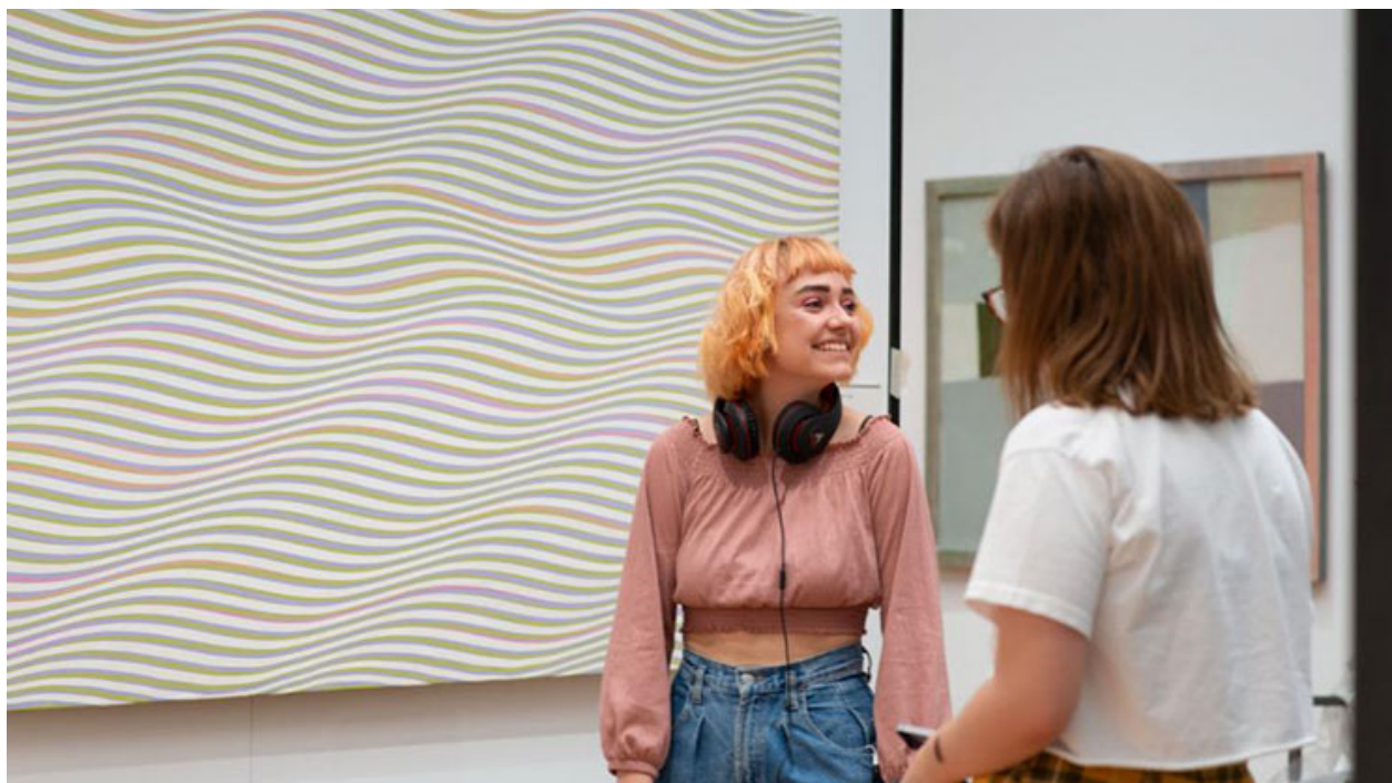
Visitors at Aberdeen Art Gallery