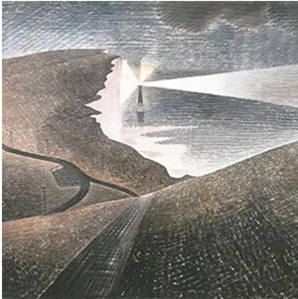
Beachy Head by Eric Ravilious, displayed at Towner Eastbourne