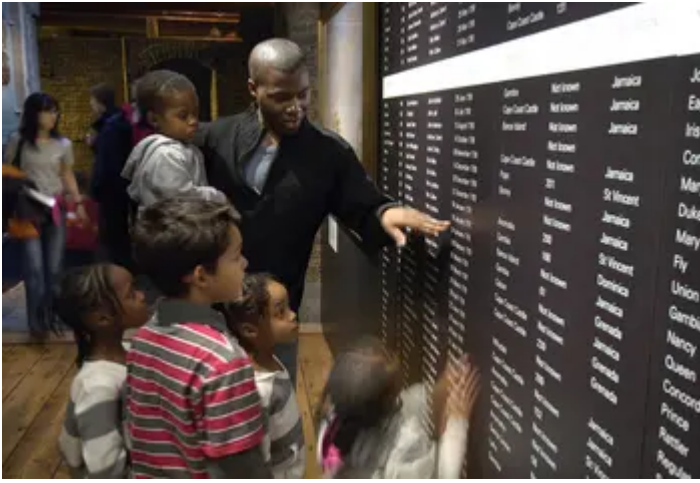
Project of the Year