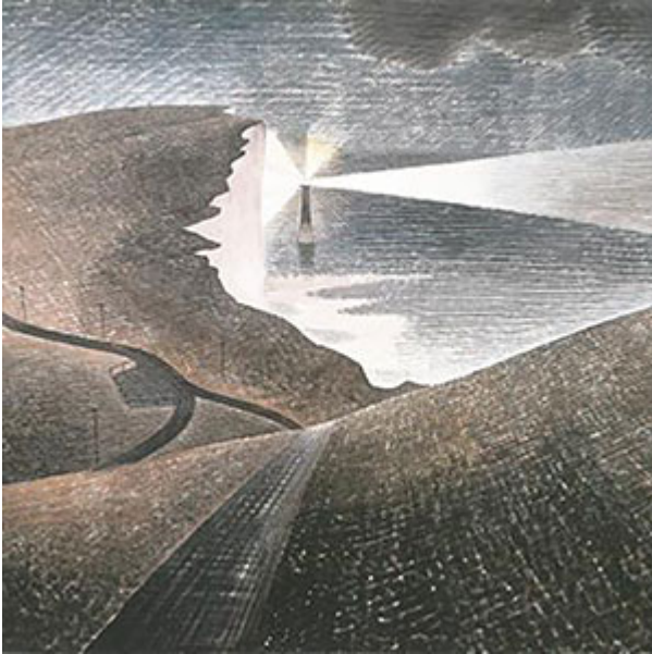
Beachy Head by Eric Ravilious, displayed at Towner Eastbourne