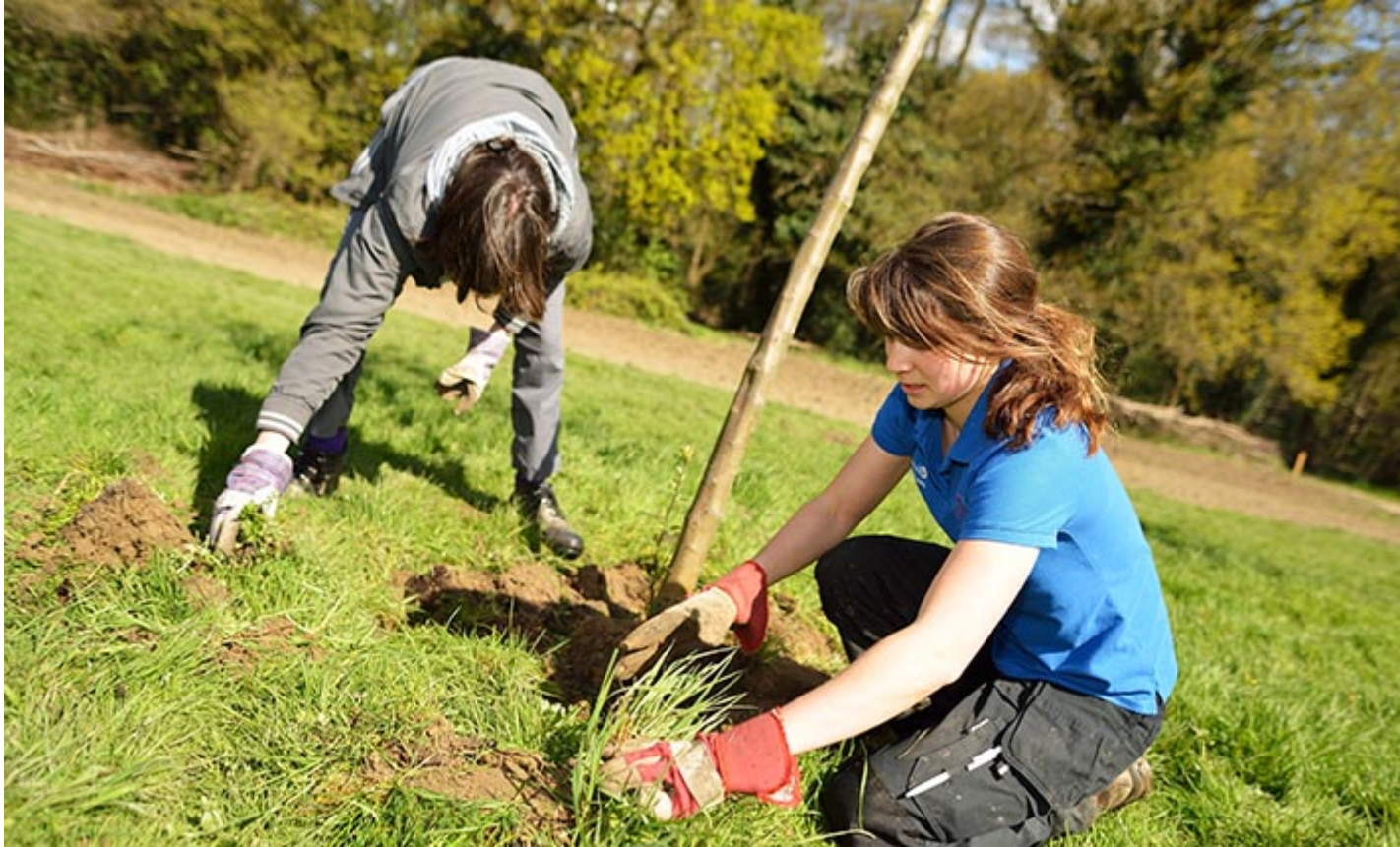
Ros has recently overseen the distribution of Government funding including the Green Recovery Challenge Fund

Ros has also overseen the distribution of substantial Government funding to support organisations through the crisis – the £92m Culture Recovery Fund for Heritage and the £40m Green Recovery Challenge Fund , to support the nature and environmental sector.