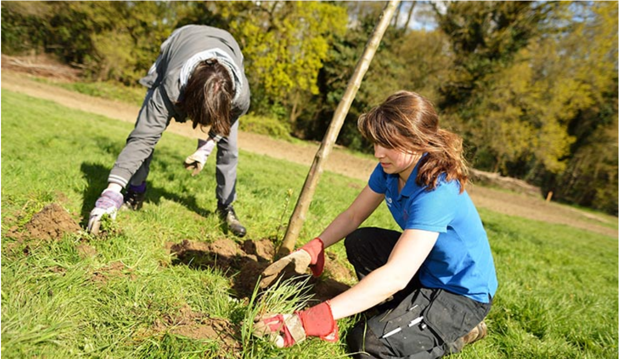
Ros has recently overseen the distribution of Government funding including the Green Recovery Challenge Fund

Ros has also overseen the distribution of substantial Government funding to support organisations through the crisis – the £92m Culture Recovery Fund for Heritage and the £40m Green Recovery Challenge Fund , to support the nature and environmental sector.