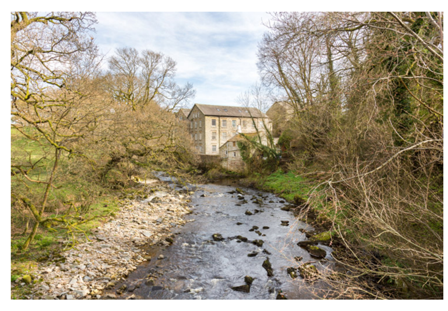
The mill received a £44,400 grant, which means it can once again showcase the importance of textile heritage to the local community of Cumbria and the Yorkshire Dales.