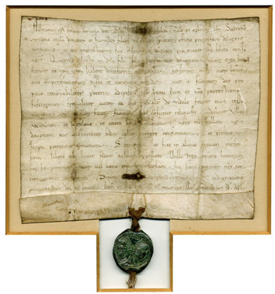
A Papal Bull from Pope Adrian IV, held at the Northumberland Archives

The archives is home to five linear miles of records dating back to 1156. Its £48,100 grant will allow the archives to refocus the delivery methods of its services, install new ways of income generation, and build in resilience.