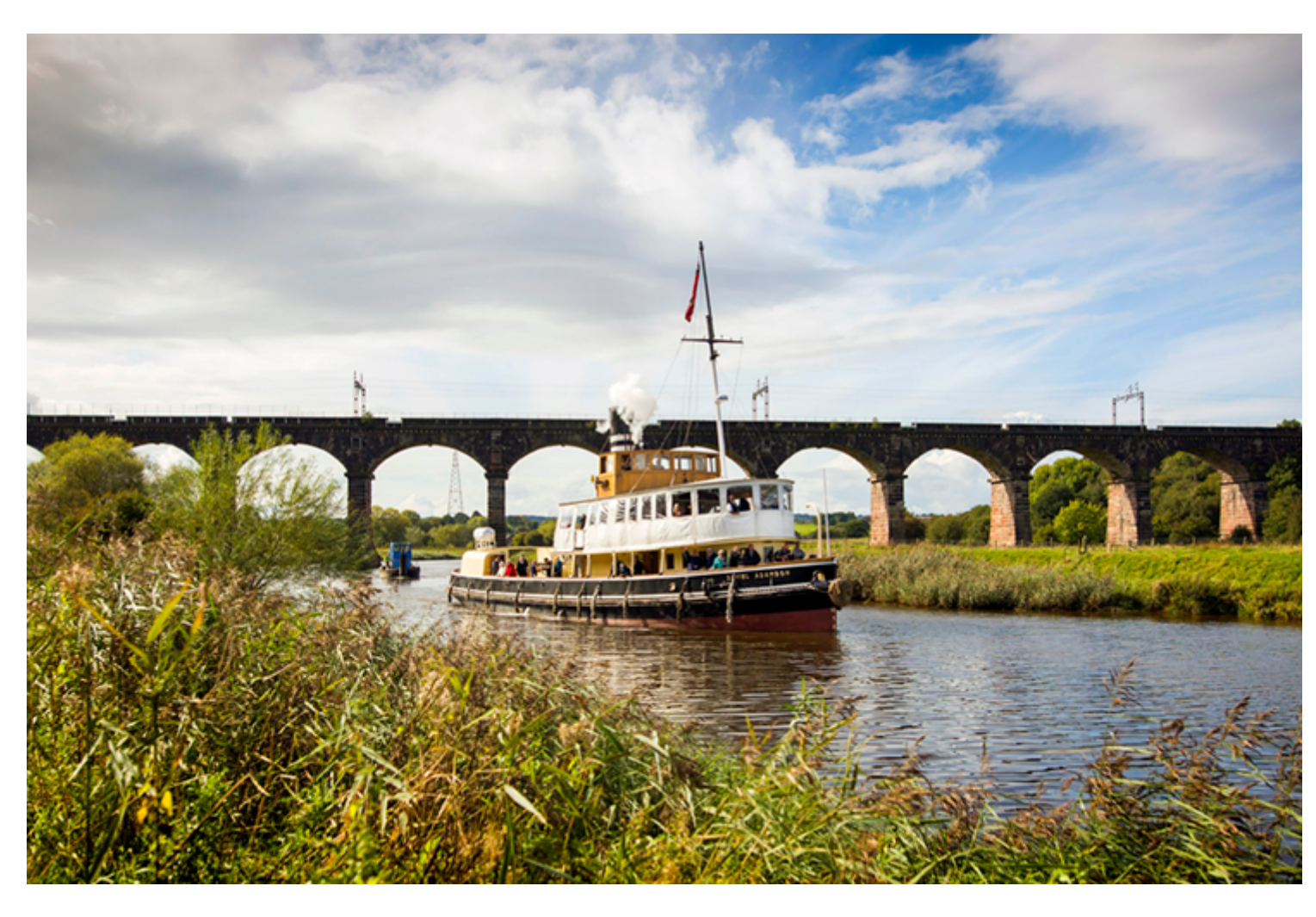
This art-deco heritage steamship and living and working museum in the north-west of England received £151,000. It will ensure the 117-year-old vessel has a chance to set sail again after the pandemic.