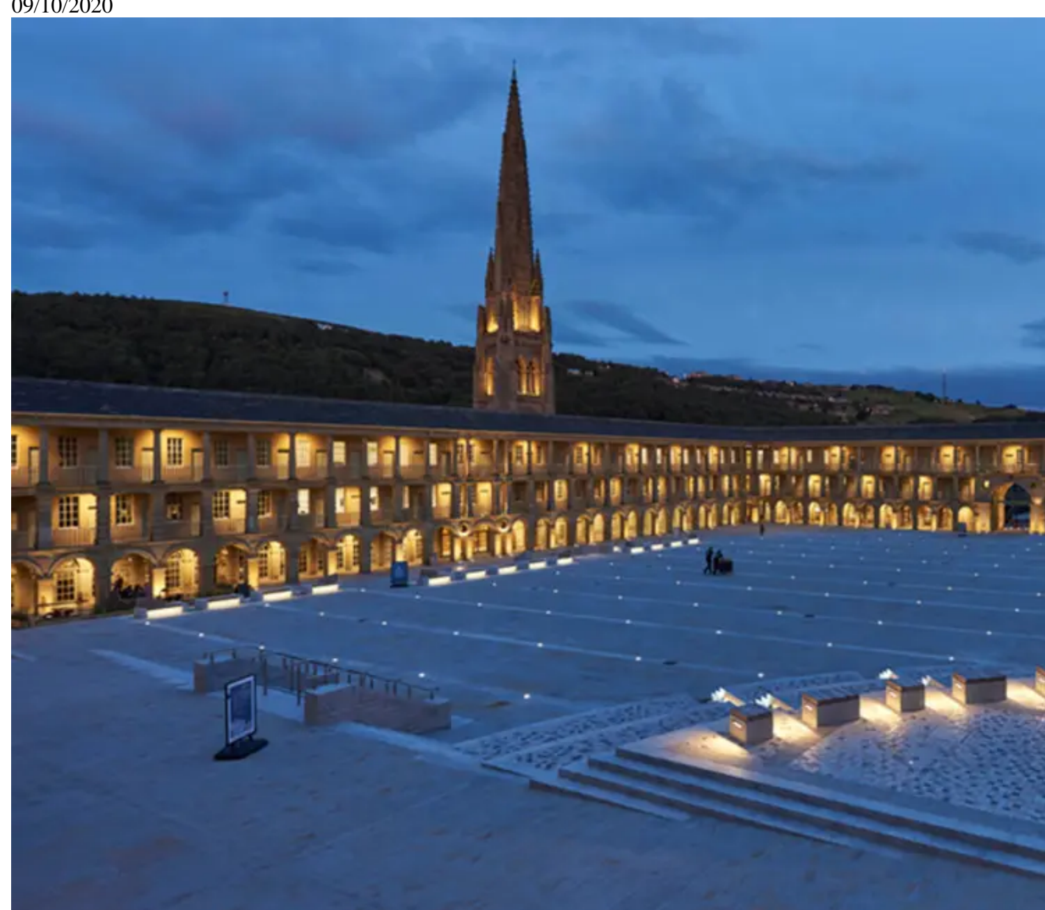
433 organisations in England have received a share of £67million in the first round of awards from the Culture Recovery Fund for Heritage.

The grants – which range from £10,000 to £1m – will protect heritage and save jobs from the impact of the coronavirus (COVID-19) crisis.