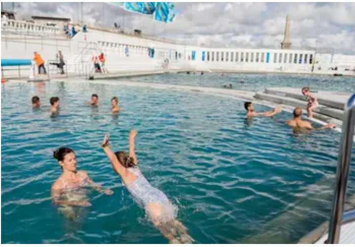
Opening of the geothermal pool