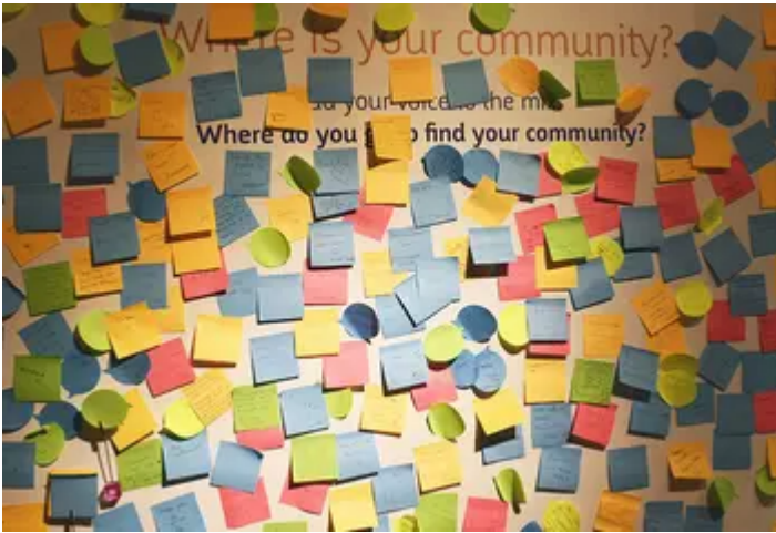
Case study: Queering Spires - a history of LGBTIQ+ spaces in Oxford