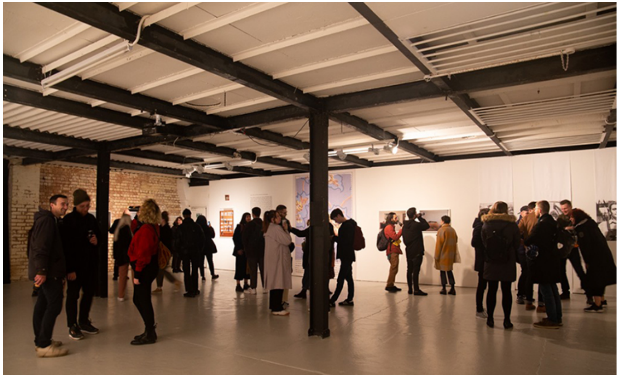
Visitors at an exhibition at Centrala before lockdown.

Centrala was launched in 2012. Since then it has played a significant role in bringing diverse audiences together, and helping people to recognise and understand the arts, culture and heritage of Central and Eastern European communities.