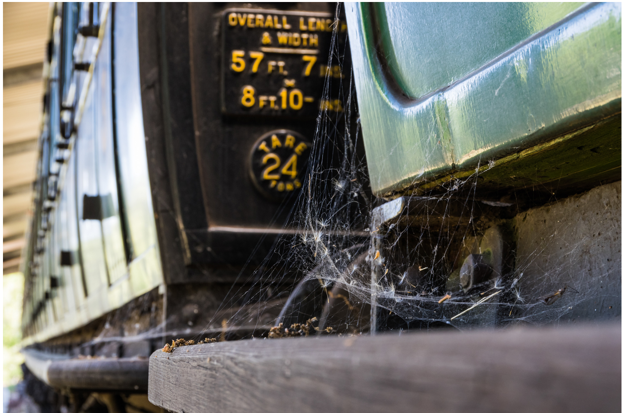
Isle of Wight Railway.