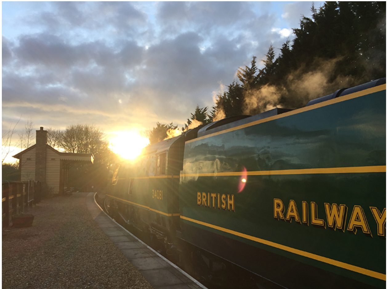
Nene Valley Railway

National Lottery funding is helping heritage railway organisations to: