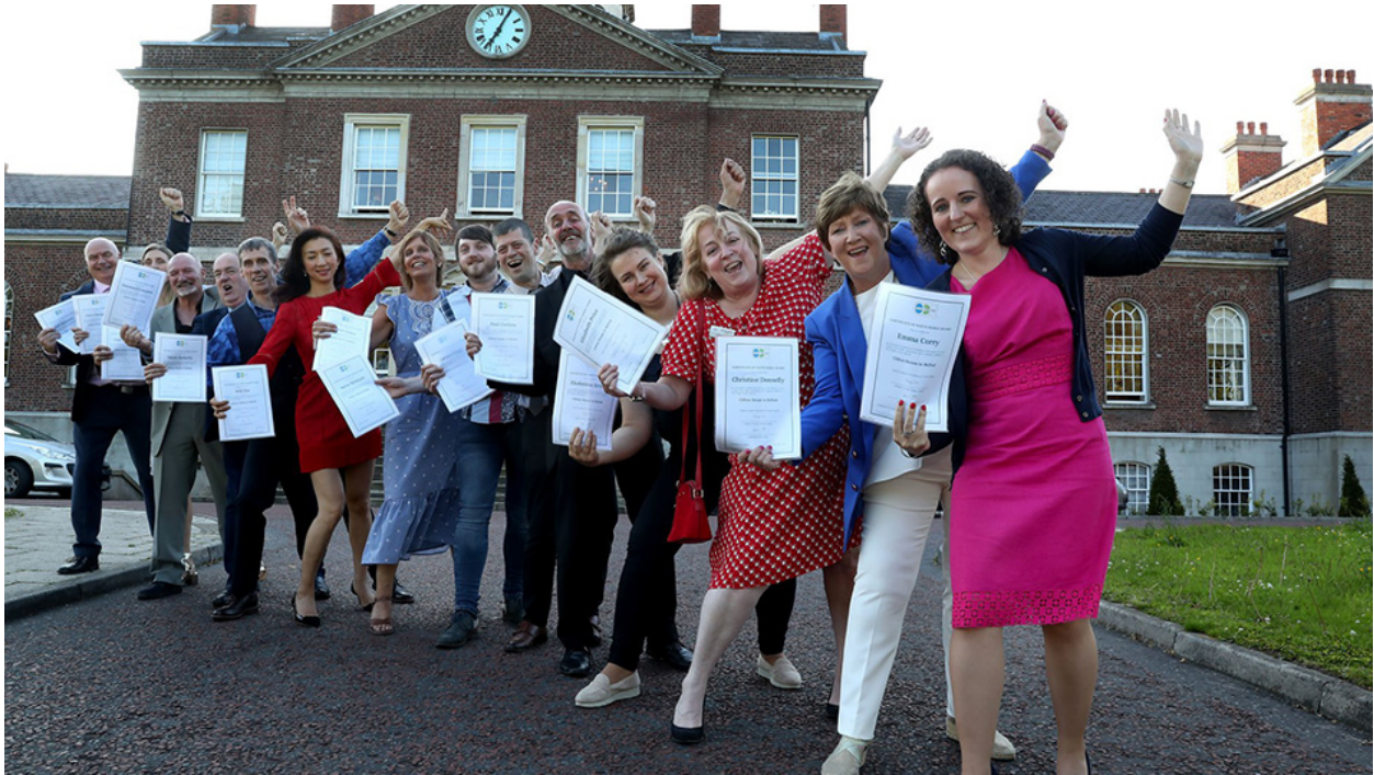
Clifton House's White Badge volunteer guides

Clifton Hall's first virtual session attracted 75 people. Subsequent sessions have seen an increase in public engagement of over 200% on this time last year.