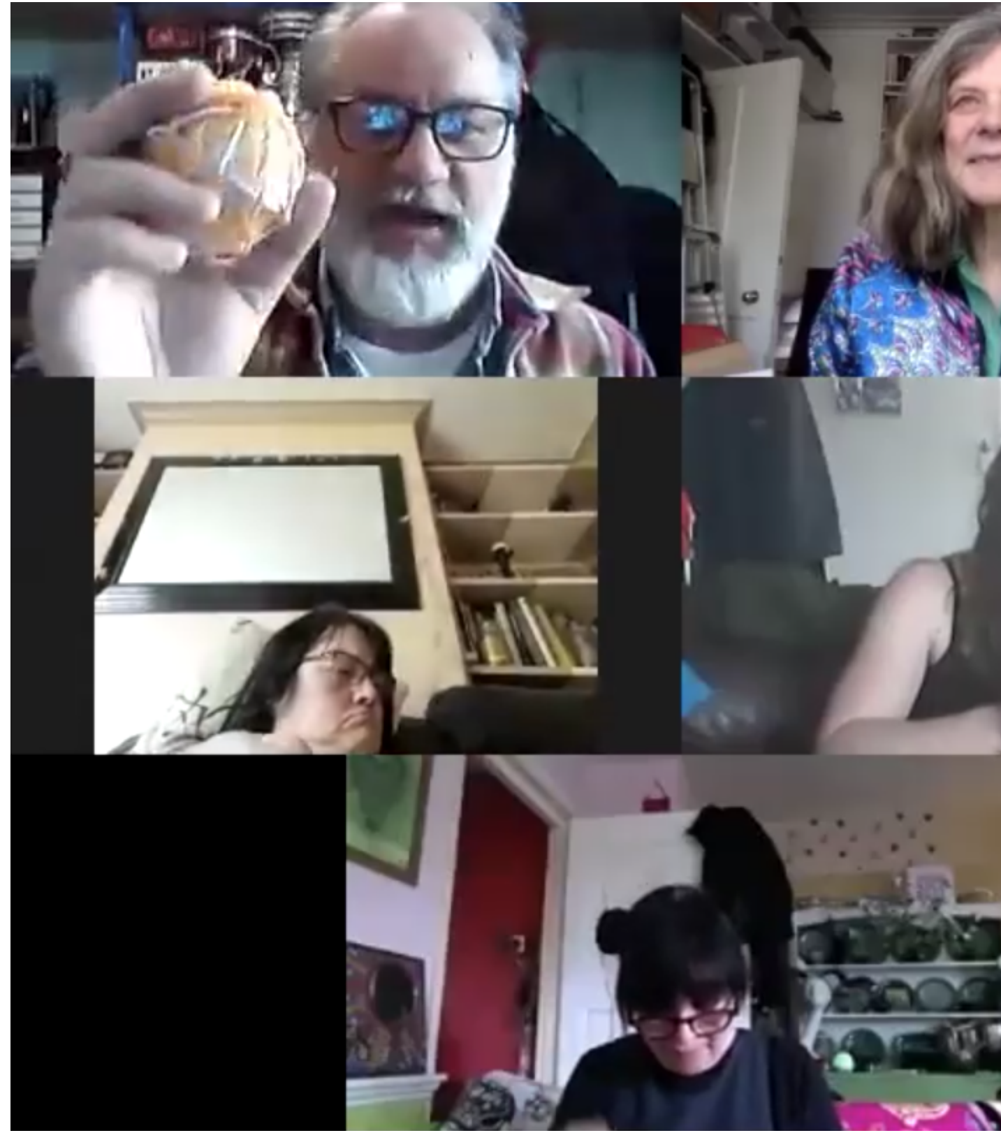
Meeting on Zoom

We also have a closed Facebook group with more than 50 members where we post creative challenges. In fact, lockdown has meant the group is more active than ever and remains a way we can pick up on if someone is having a down day.