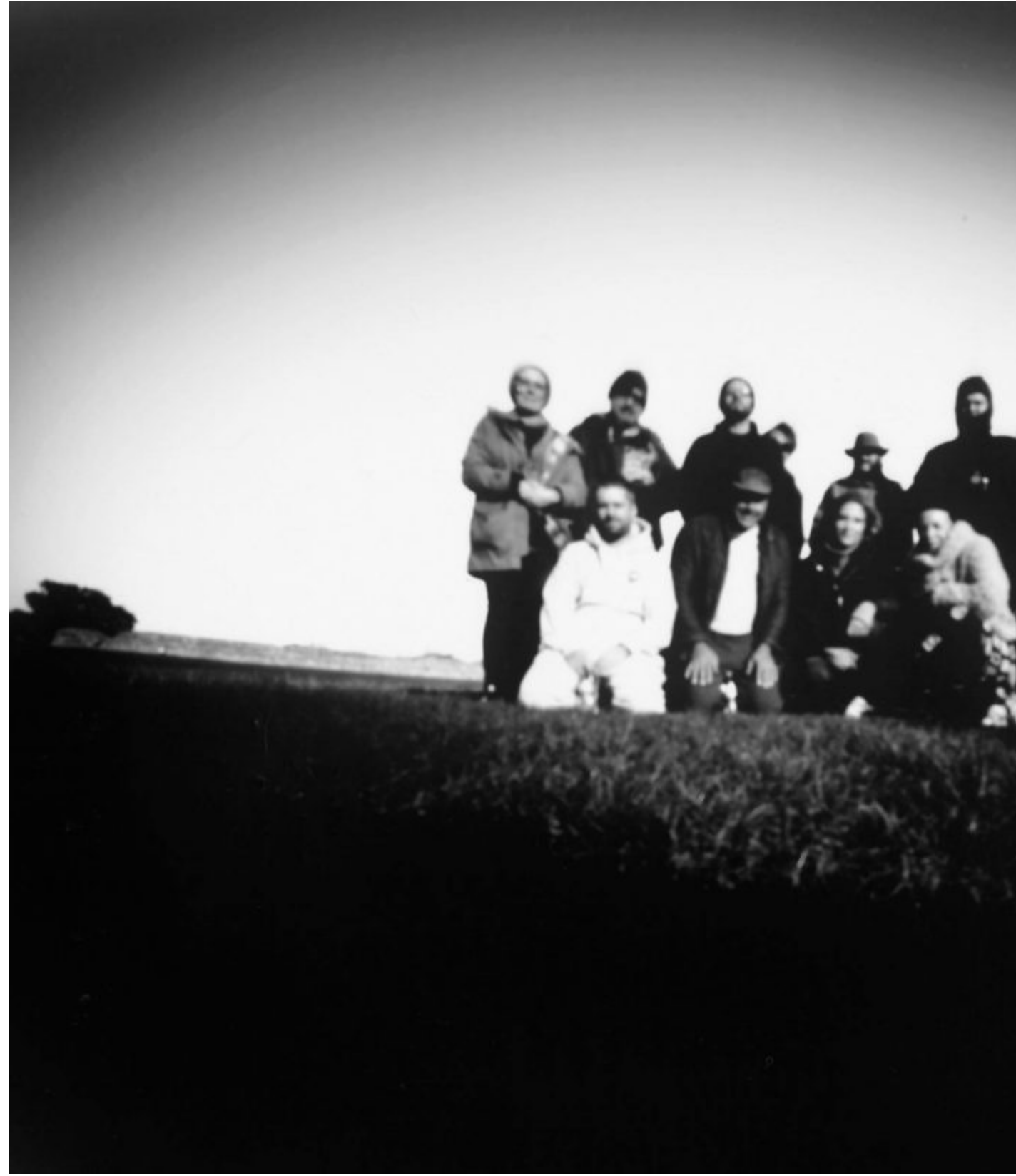
Burgh Castle Almanac group

Now I'm connected to the world again I want to take this experience as far as I can and I want to give back to the project and people what they have given to me.