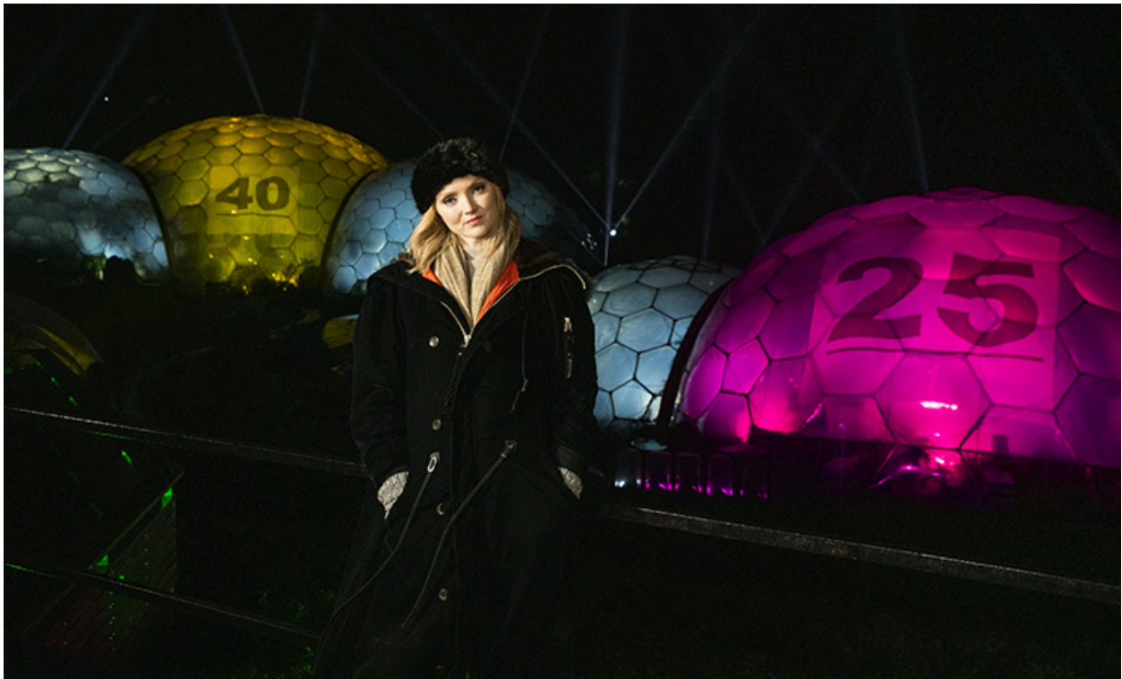
Lily Cole at the Eden Project last night, where she helped turn the Biomes into National Lottery balls

To view the full list please visit the Thanks to You website .