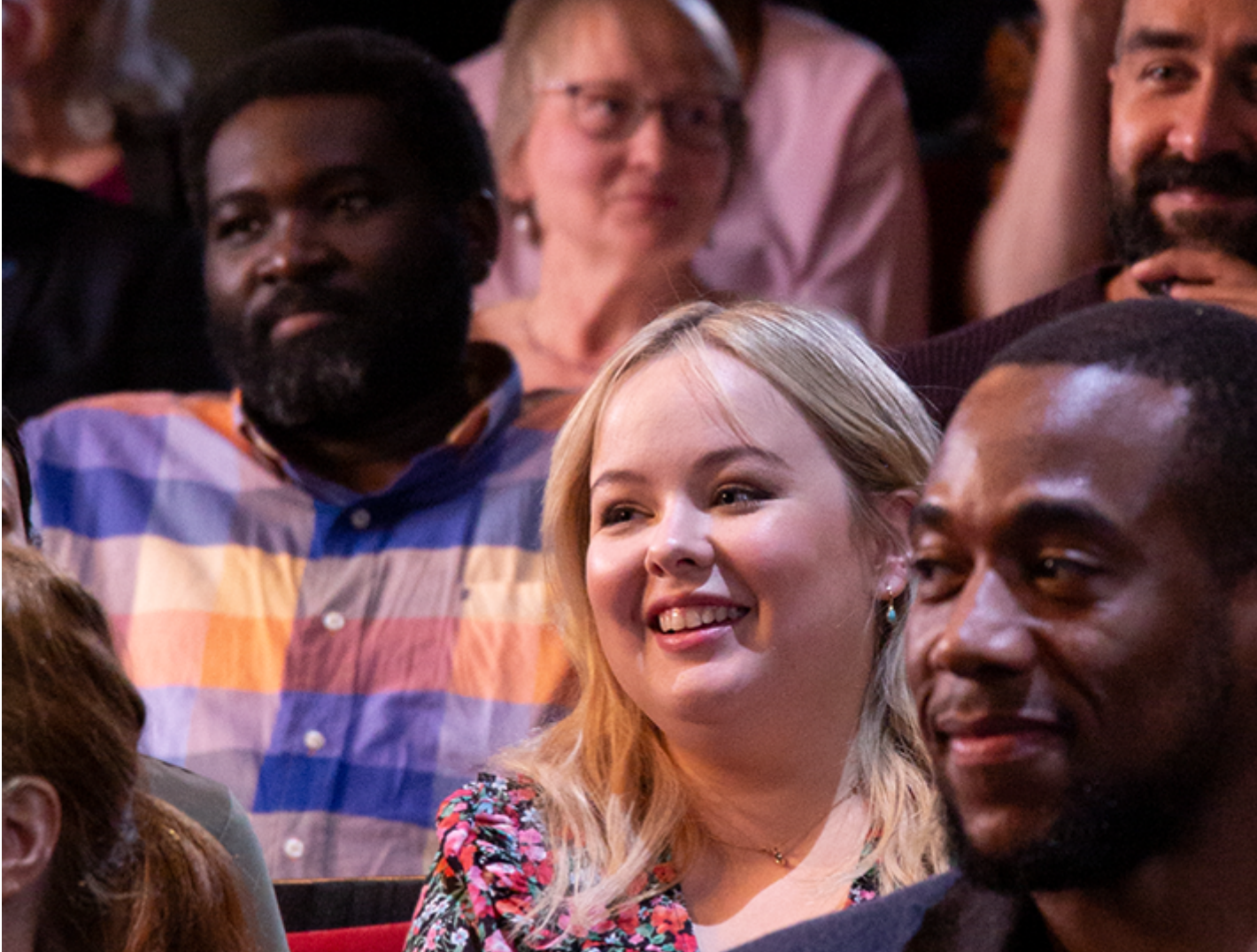
Derry Girls star Nicola Coughlan was in the crowd to celebrate National Lottery funding

Athletes, stars of the screen and other famous faces add their ideas to a fast-growing list of how £40billion of National Lottery funding has changed people's lives in the areas of sport, arts, community and heritage.