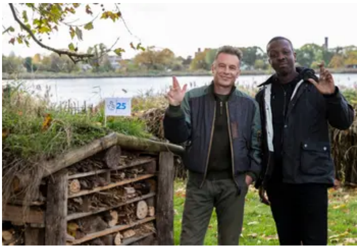
of her home city

Chris Packham and Jamal Edwards celebrate 25 years of funding for nature