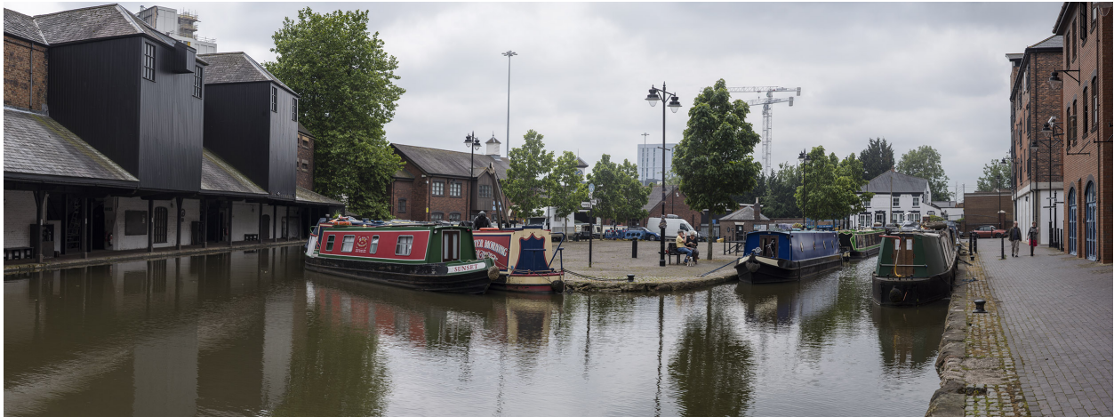
Coventry canal.