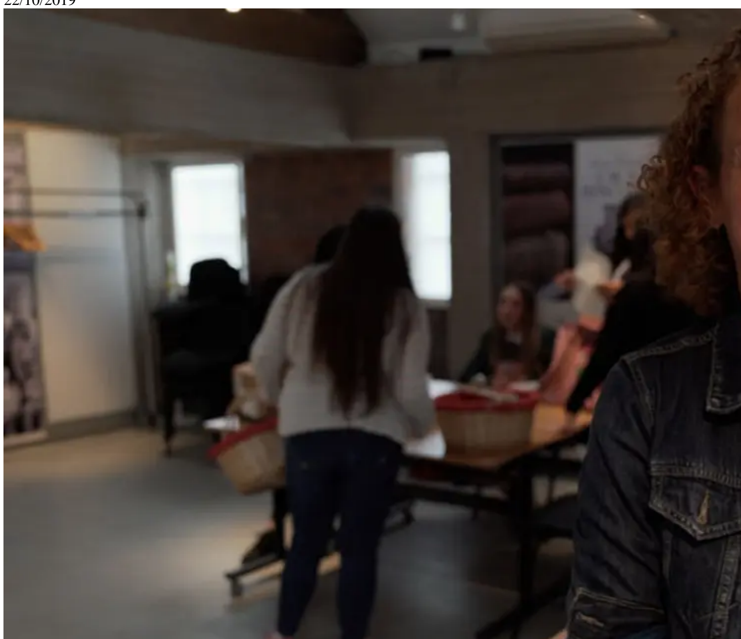
Once a bustling hub of the Industrial Revolution, after years of decline Rochdale is facing a brighter future thanks in part to 25 years of National Lottery investment.

"The River Roch ran beneath our feet encased in slabs of grey concrete