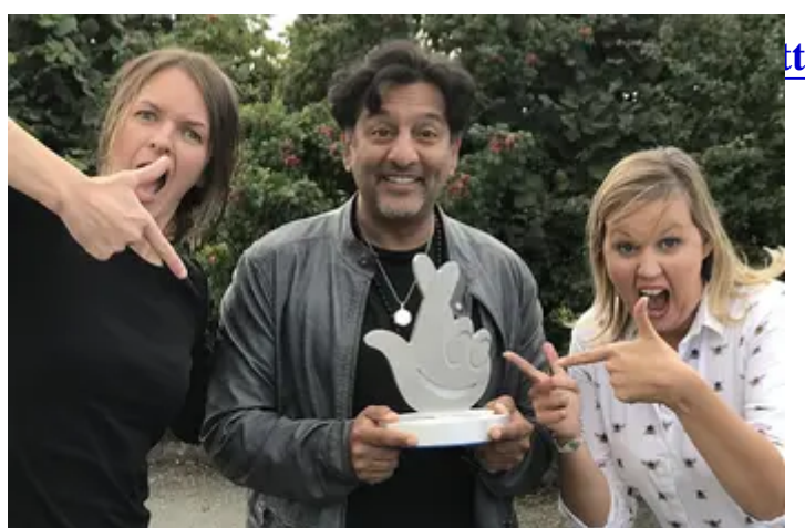
tery is 25