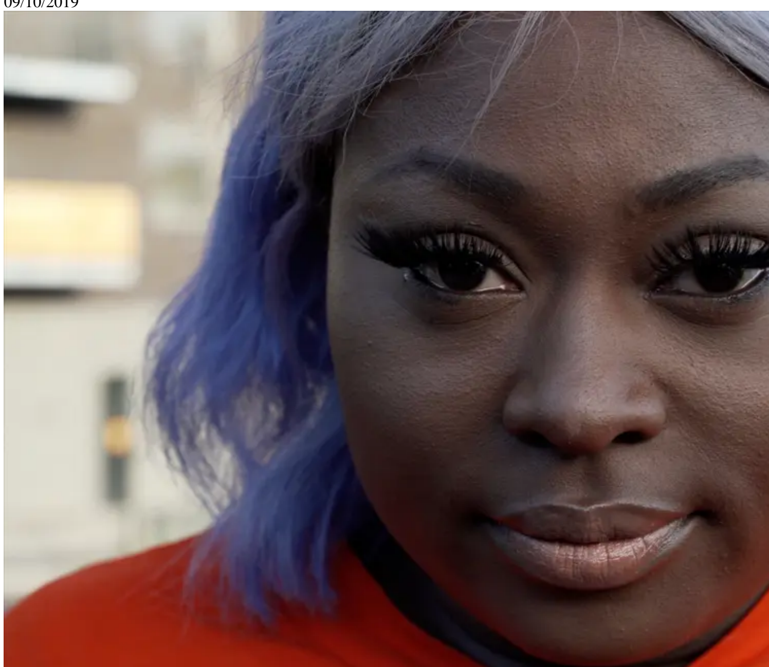
To celebrate The National Lottery's 25th Birthday, three very different groups in Waltham Forest share their stories of how its investment has transformed a place they love.