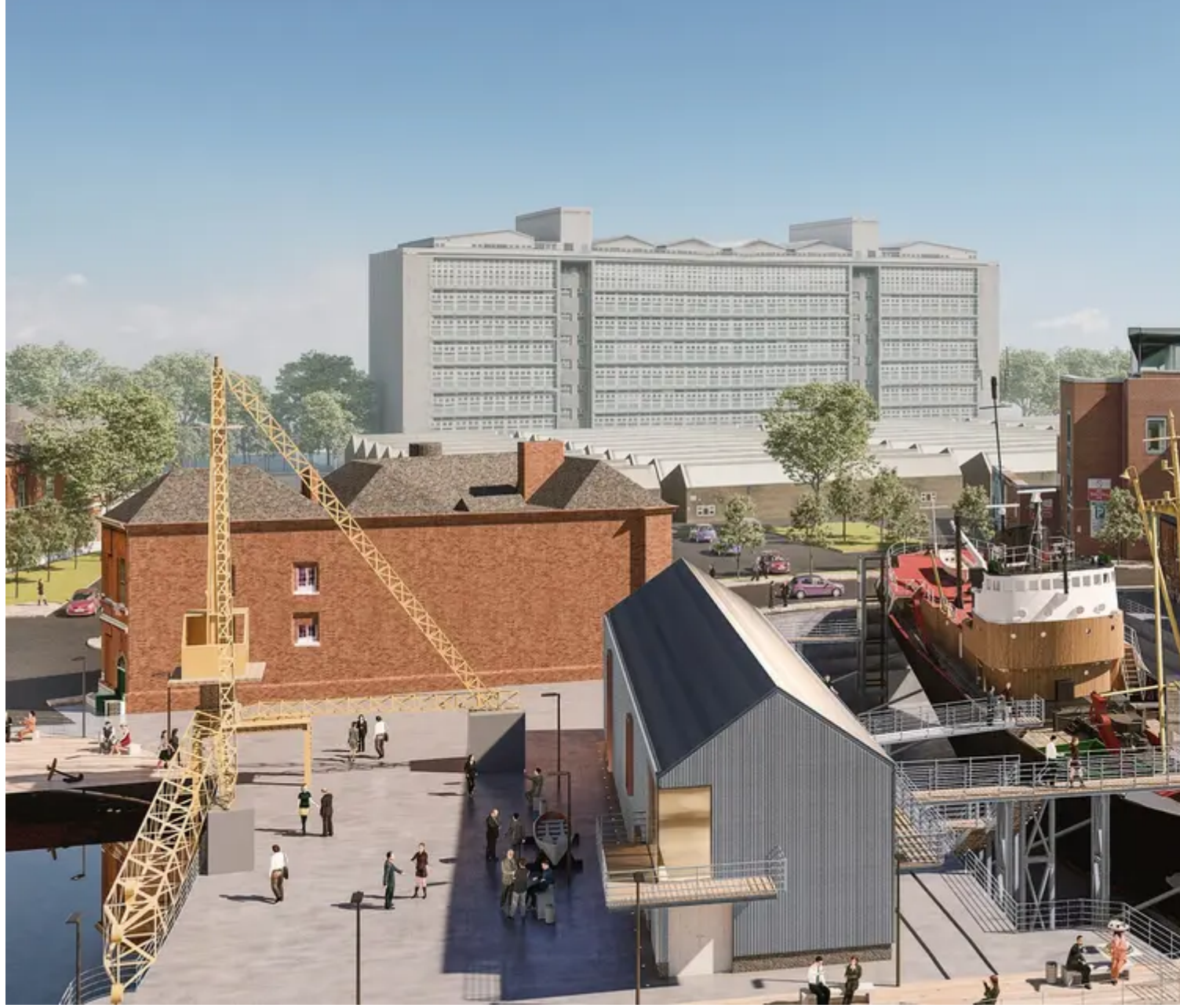
800 years of Hull's maritime history to be placed at heart of its future thanks to "game-changer" regeneration plans.

Following the success of the <u>UK City of Culture 2017</u>, Hull is using the momentum to transform its rich heritage and become a world-class visitor destination.