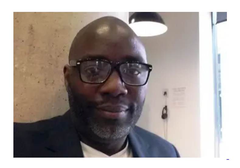
"Johnny Just Come": telling the stories of Nigerian immigrants