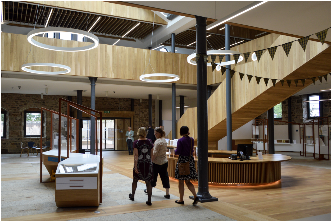
Architects have tried to incorporate much of the original structure in the new building

Before it was chosen as the new home for Cornwall's history, the Redruth Brewery site had been derelict for a decade and badly damaged by the elements and vandalism. Fortunately, architects have been able to be faithful to the original structure, incorporating elements such as the authentic pillars and granite floors.