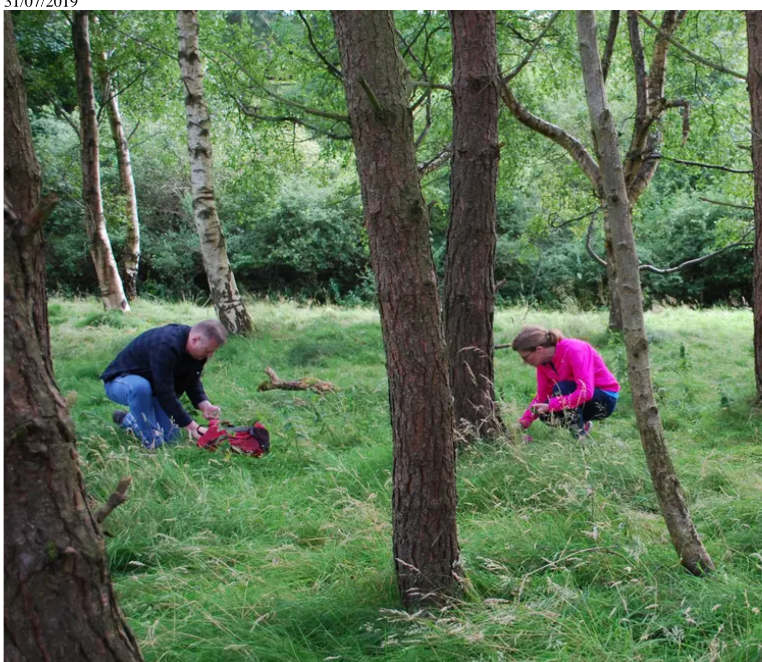
Foraging for food is a wonderful way to enjoy and learn more about our beautiful wild places. Four foragers tell us about their favourite finds.