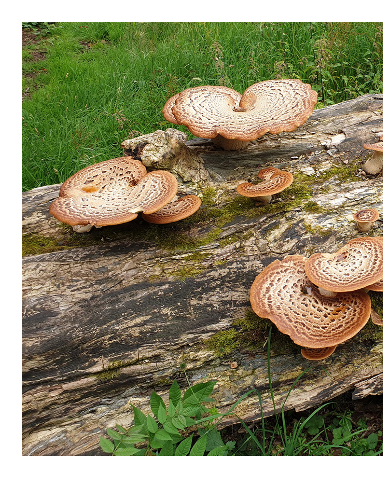
Dryad's Saddles are huge mushrooms that actually taste of watermelon! They are fairly common, but an amazing sight when you see them in full fruit: the cap can get to more than 50cm in diameter.